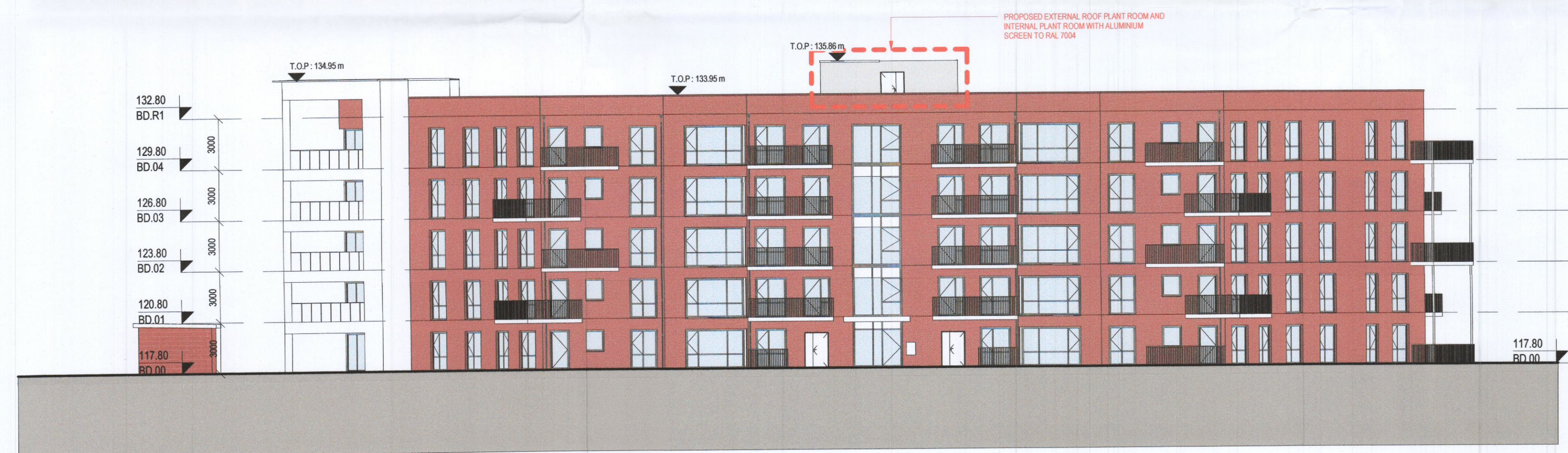
3 PROPOSED - BLOCK D - EAST ELEVATION Scale: 1 : 200

THIS DRAWING WAS PRODUCED AND SUBMITTED TO PLANNING BY JOHN FLEMING ARCHITECTS AND REMAINS THEIR COPYRIGHT