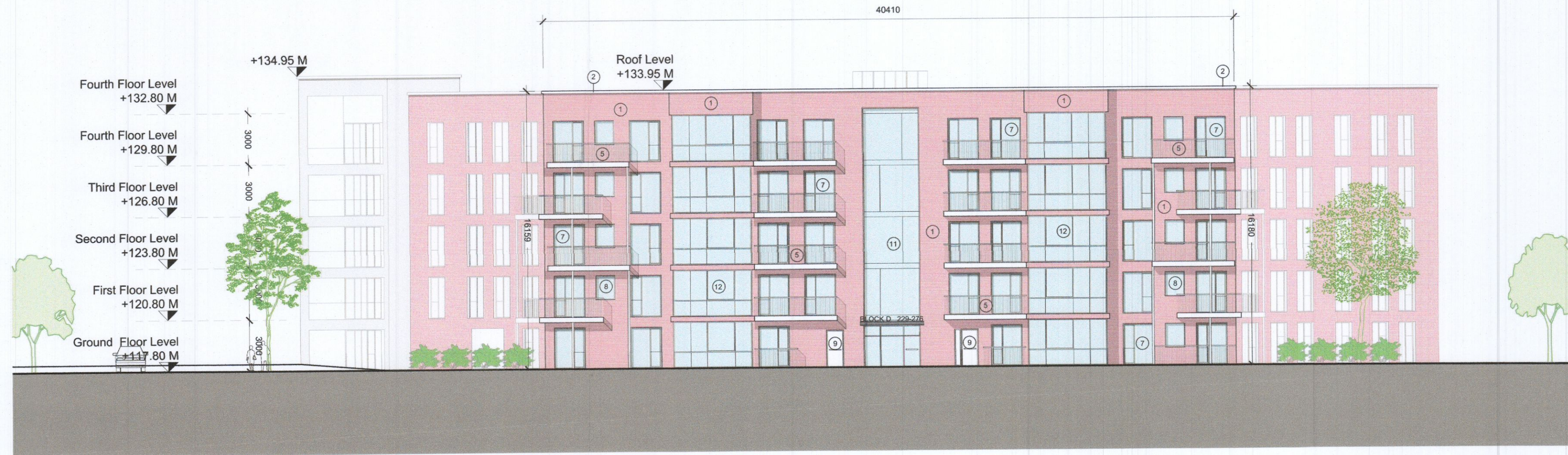
1 EXISTING - BLOCK D - EAST ELEVATION - PLANNING REF ABP-305556-19 Scale: 1 : 200

THIS DRAWING WAS PRODUCED AND SUBMITTED TO PLANNING BY JOHN FLEMING ARCHITECTS AND REMAINS THEIR COPYRIGHT