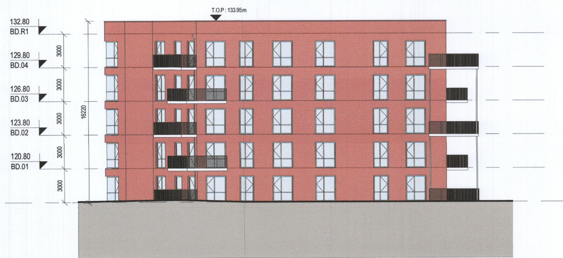
4 PROPOSED - BLOCK D - NORTH ELEVATION Scale: 1 : 200