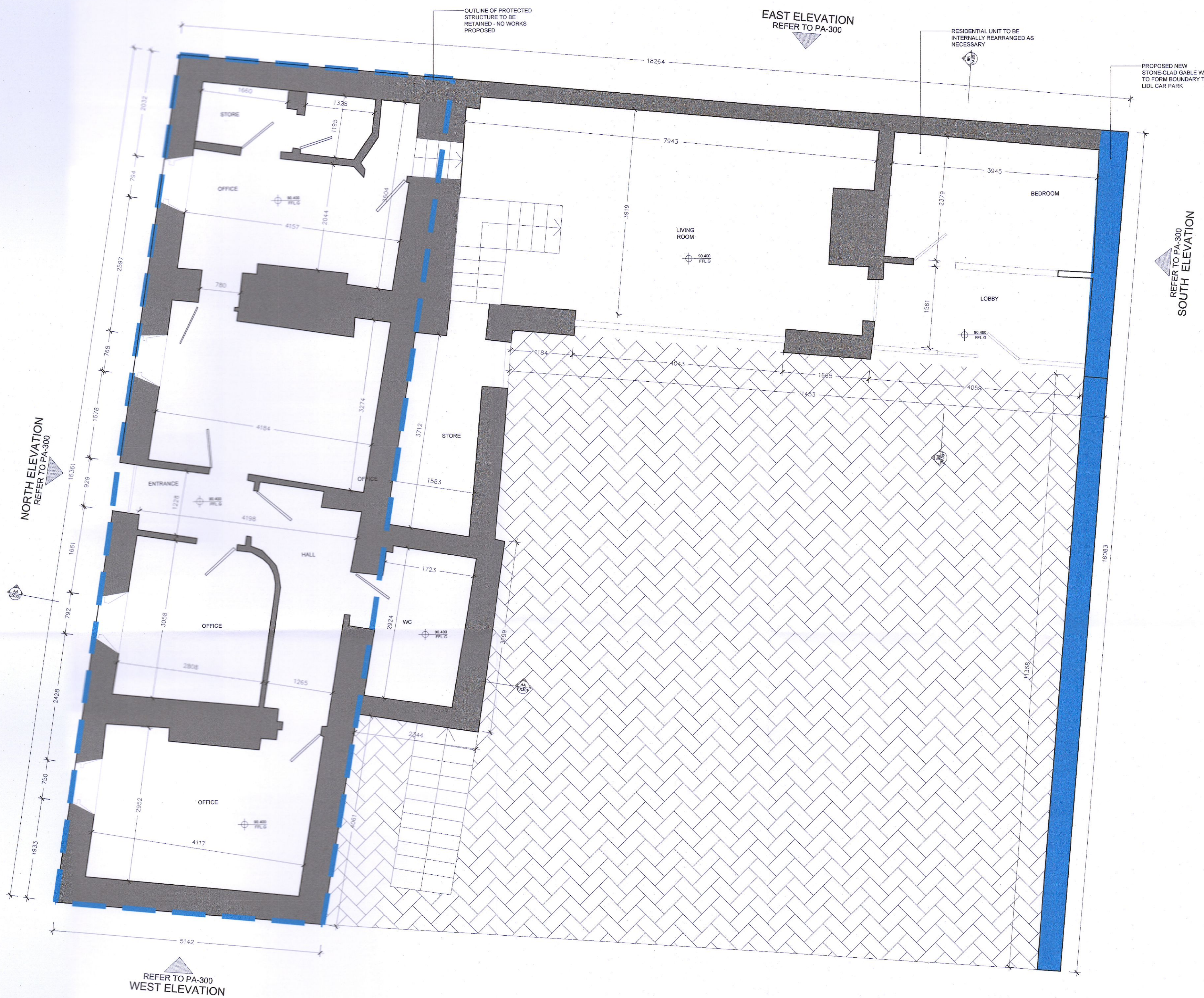
01 Building A - Proposed Ground Floor Plan PA 100 1:50