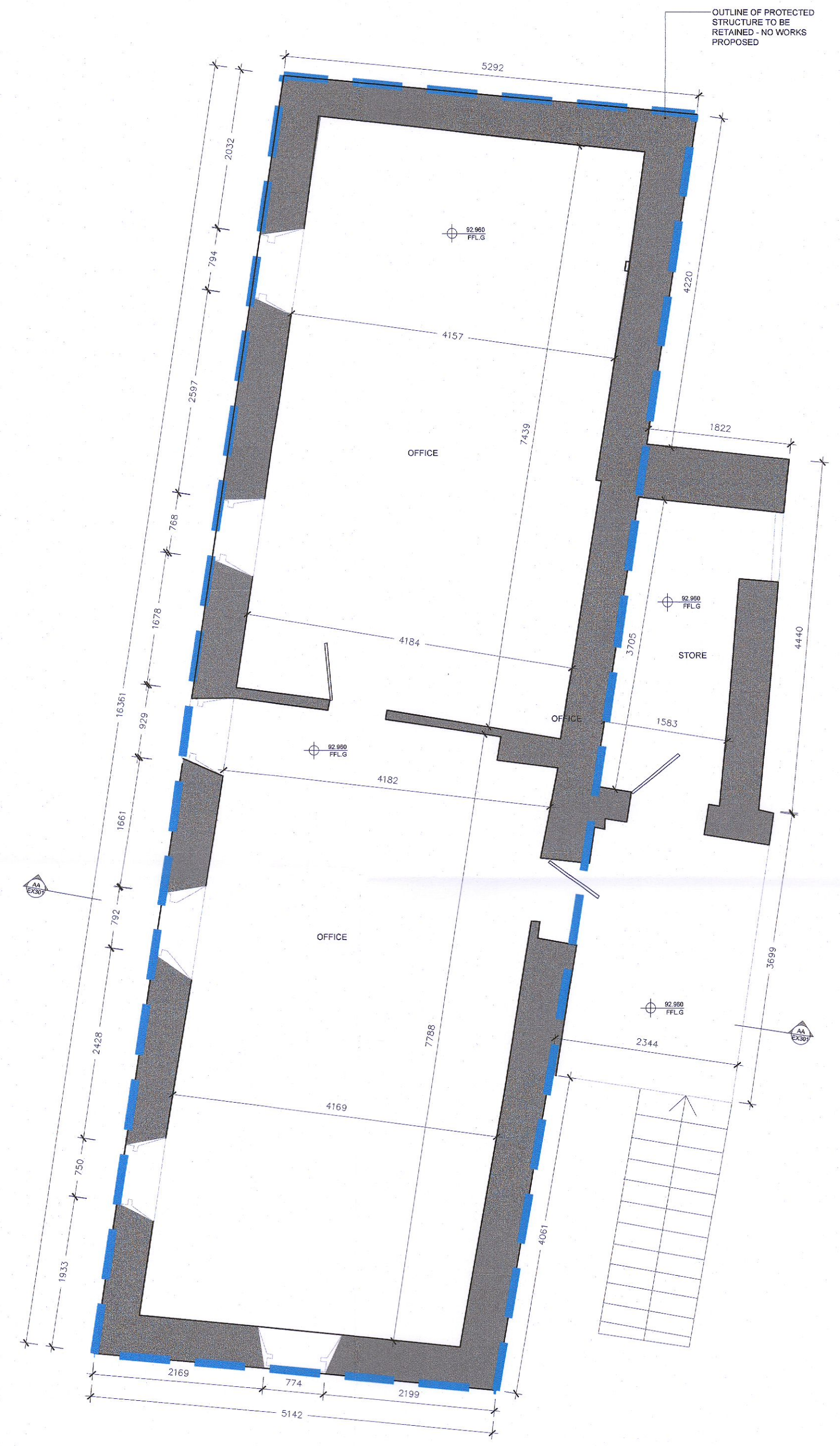
02 Building A - Proposed First Floor Plan PA 100 1:50

NOTES: Do not scale from this drawing. Any discrepancies found on site to be reported to Darmody Architects immediately. Any discrepancies found on drawings to be reported to Darmody Architects immediately. Refer to engineers drawings for structural details. All dimensions sized to blockwork.