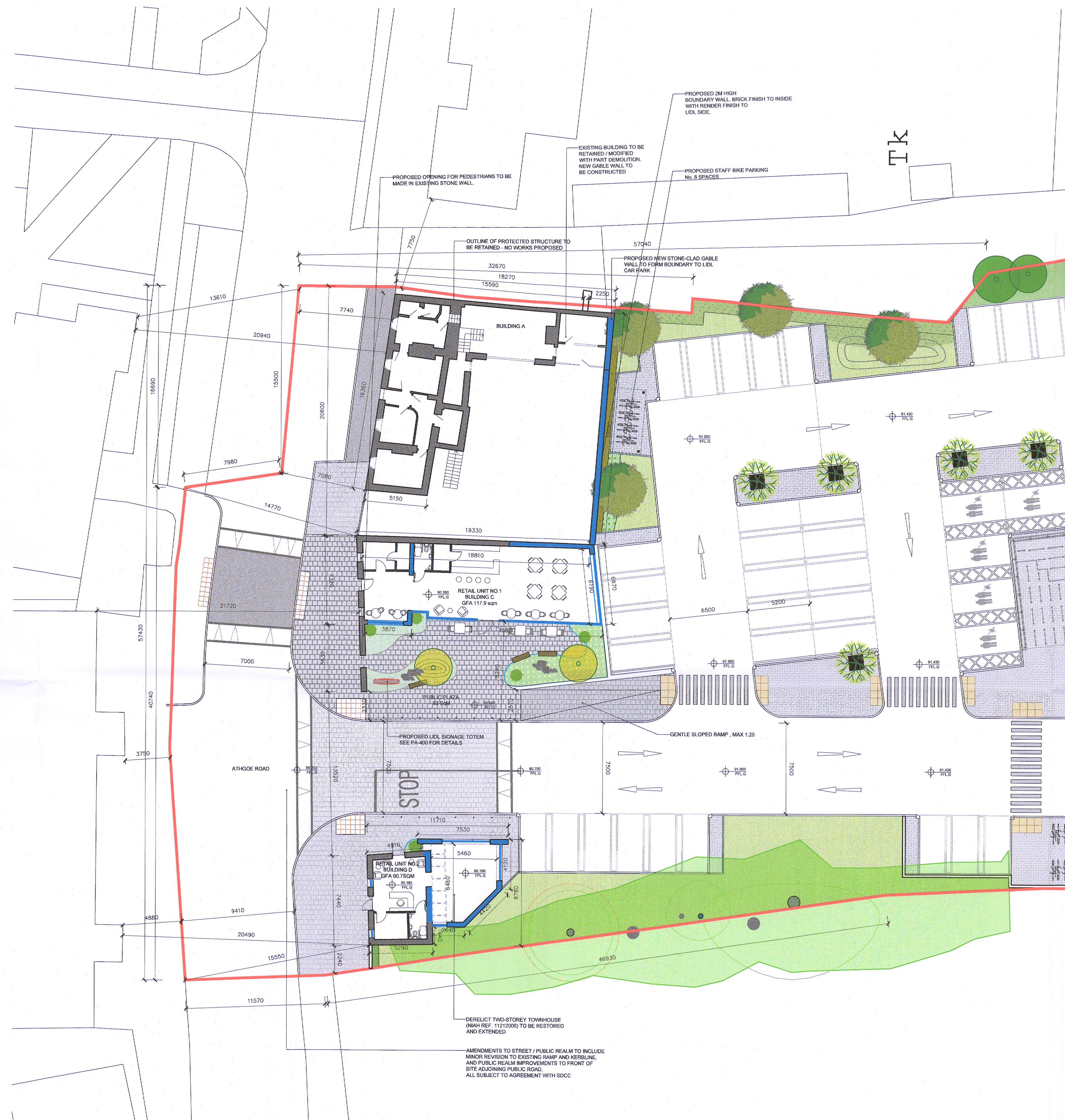
01 Proposed Site Plan - Entrance PA 002 1:200

NOTES: Do not scale from this drawing. Any discrepancies found on site to be reported to Darmody Architects immediately. Any discrepancies found on drawings to be reported to Darmody Architects immediately. Refer to engineers drawings for structural details. All dimensions sized to blockwork.