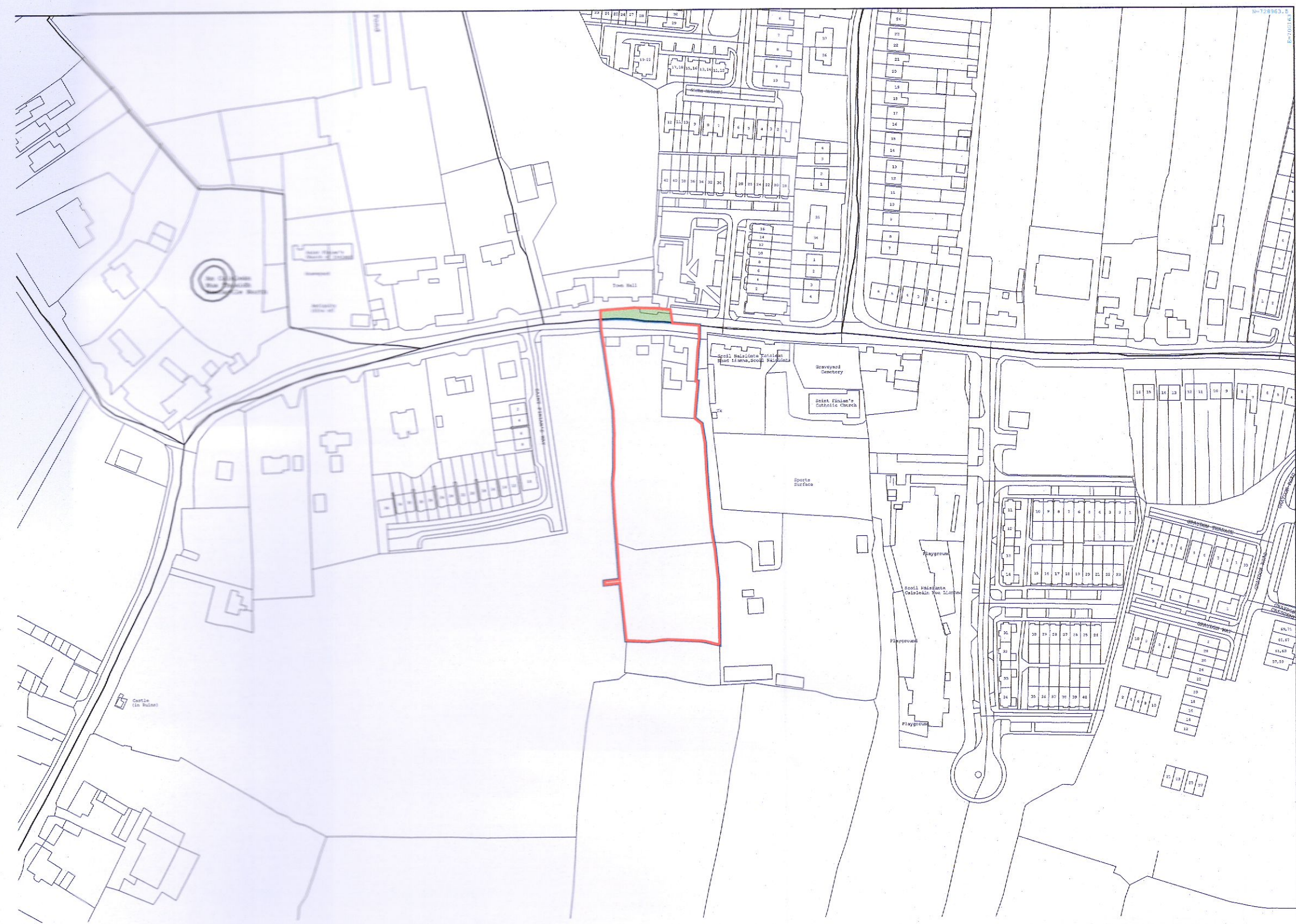
01 Local Map PA 000 1:2500

Description: Digital Landscape Model (DLM) Publisher / Source: Ordnance Survey Ireland (OSI) Data Source / Reference: PRIME2 File Format: Autodesk AutoCAD (DWG_R2013) File Name: v_50265853_1.dwg Clip Extent / Area of Interest (AOI): LLX,LLY= 699673.8087,728500.9025 LRX,LRV= 699919.8087,728500.9025 ULX,ULY= 699673.8087,728832.9025 URX,URV= 699919.8087,728832.9025 Projection / Spatial Reference: Projection= IRENET95_Irish_Transverse_Mercator Centre Point Coordinates: X,Y= 699796.8087,728666.9025 Reference Index: Map Series | Map Sheets 1:2,500 | 3387-B Data Extraction Date: Date= 04-May-2022 Source Data Release: DCMLS Release V1.151.113 Product Version: Version= 1.4 License / Copyright: Ordnance Survey Ireland 'Terms of Use' apply. Please visit 'www.osi.ie/about/terms-conditions'.