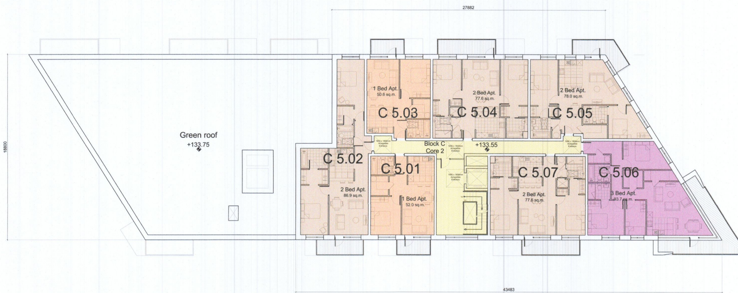
1 BLOCK C - EXISTING FIFTH FLOOR PLAN PLANNING REF ABP-305556-19 Scale: 1 : 200