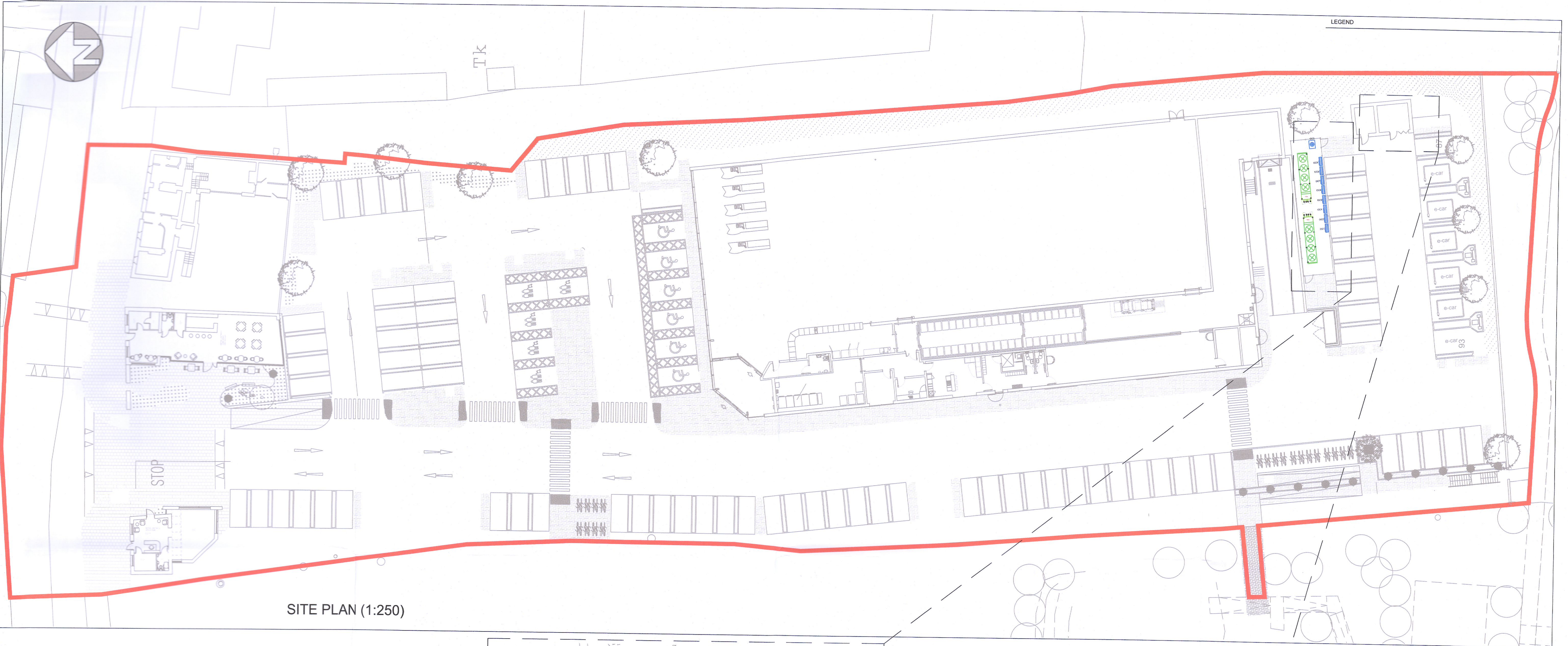
SITE PLAN (1:250)