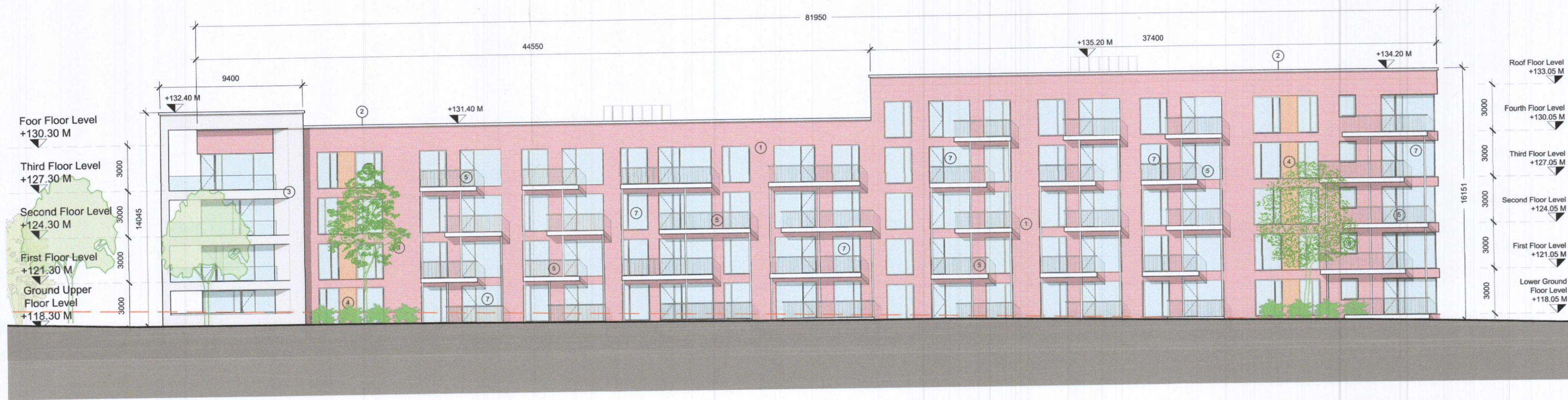
1 EXISTING - BLOCK B - SOUTH ELEVATION - PLANNING REF ABP-305556-19 Scale: 1 : 200