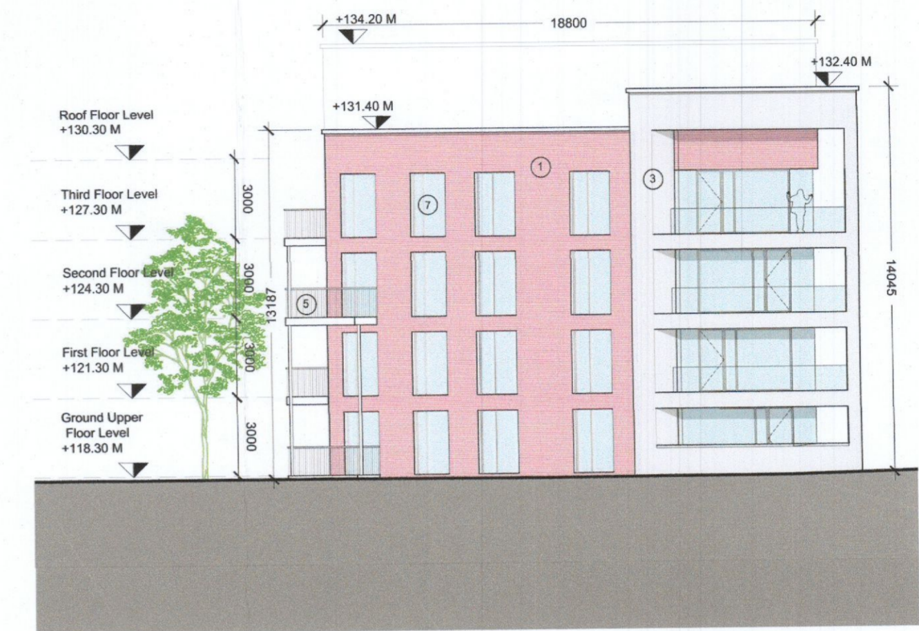
2 EXISTING - BLOCK B - WEST ELEVATION - PLANNING REF ABP-305556-19 Scale: 1 : 200