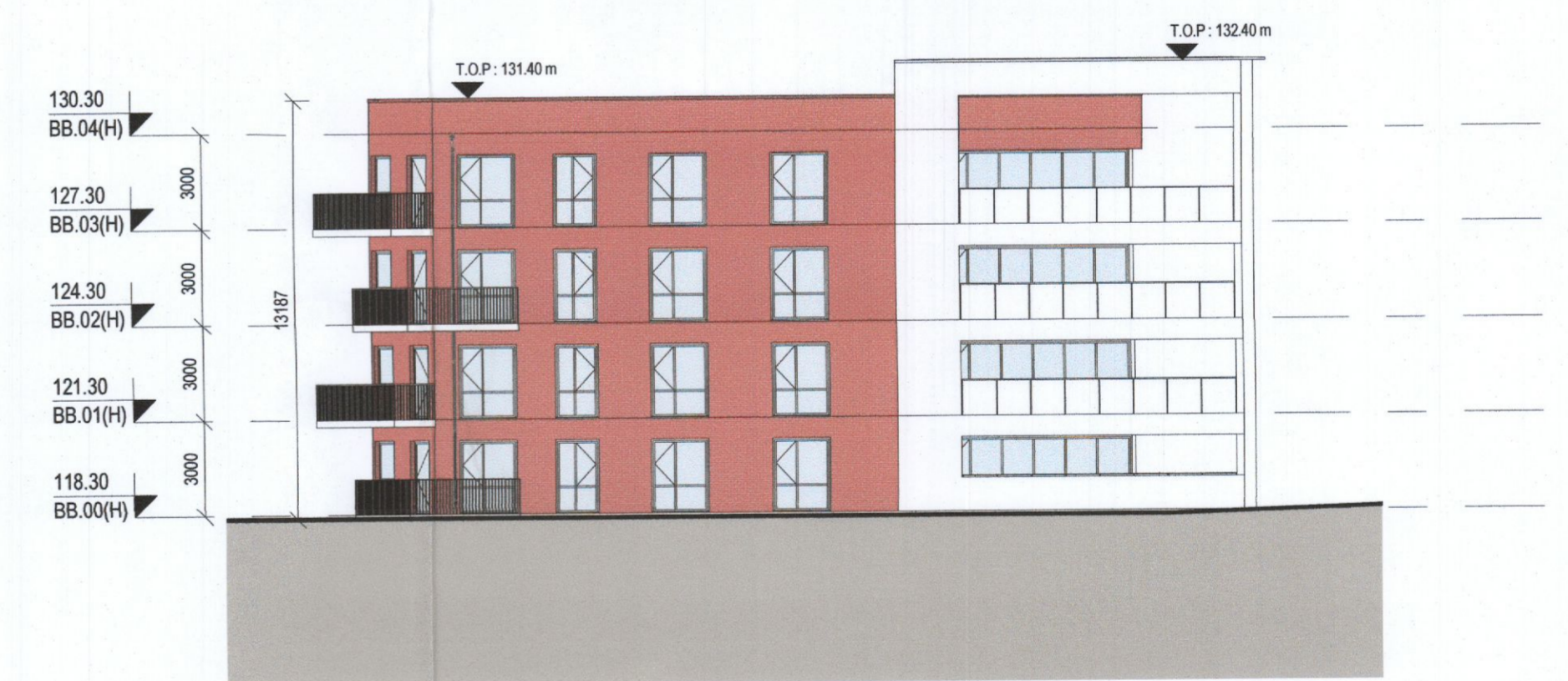
4 PROPOSED - BLOCK B - WEST ELEVATION Scale: 1 : 200