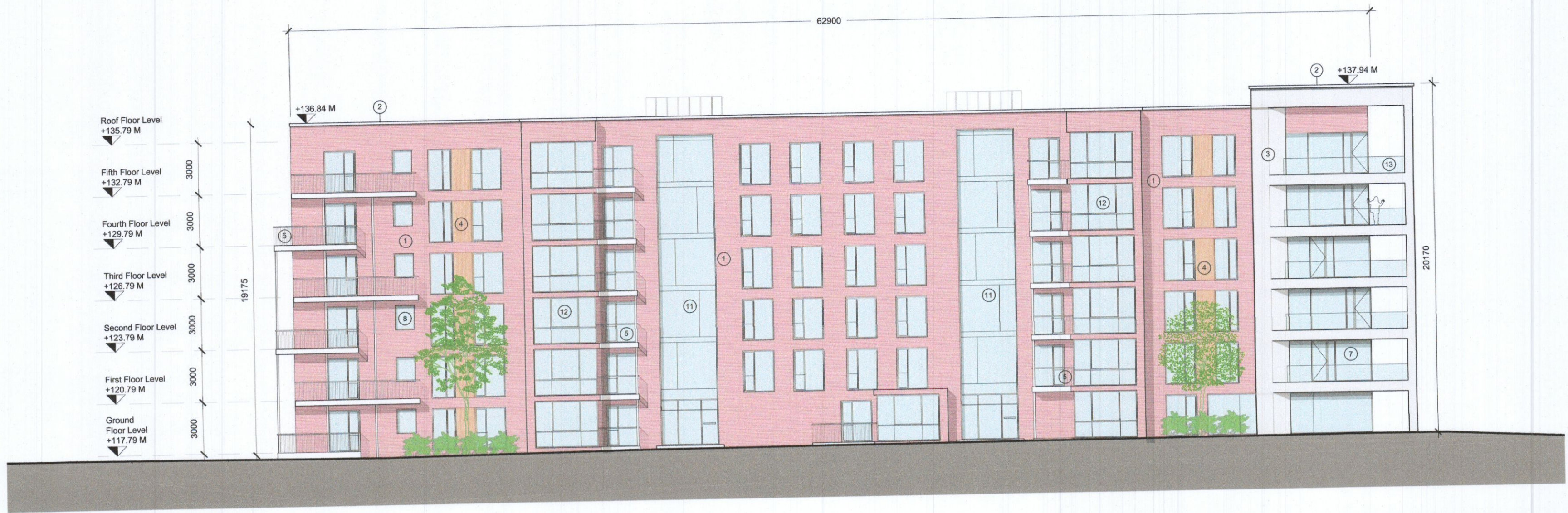
1 EXISTING - BLOCK A - NORTH ELEVATION - PLANNING REF ABP-305556-19 Scale: 1 : 200

THIS DRAWING WAS PRODUCED AND SUBMITTED TO PLANNING BY JOHN FLEMMING ARCHITECTS AND REMAINS THEIR COPYRIGHT