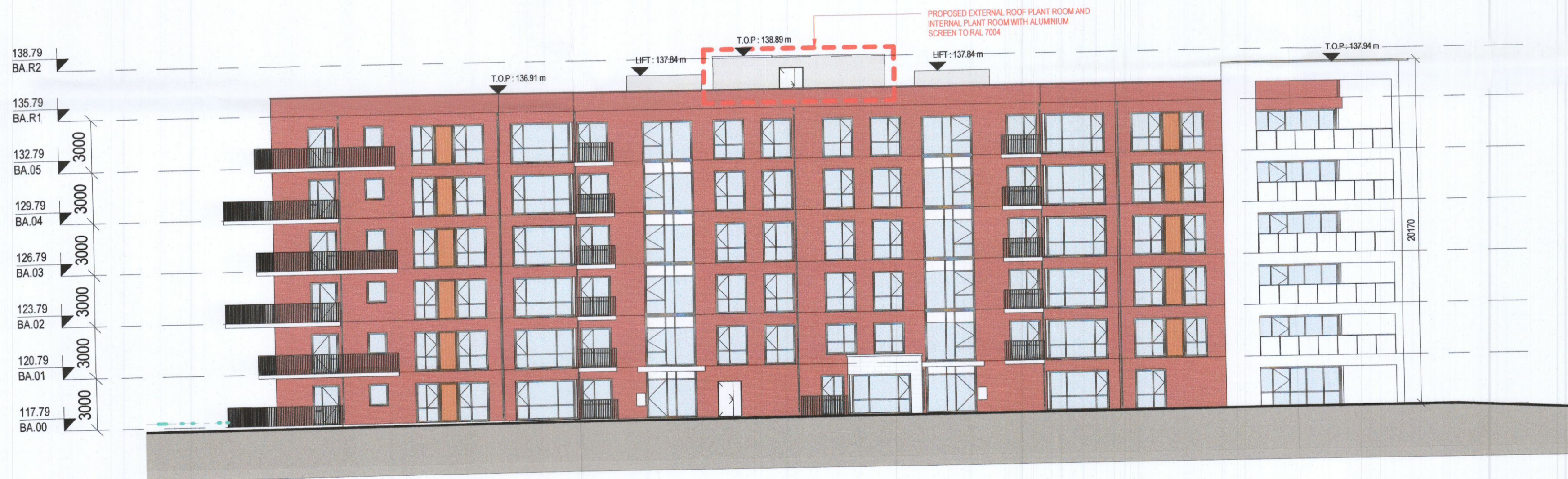
3 PROPOSED - BLOCK A - NORTH ELEVATION Scale: 1 : 200

THIS DRAWING WAS PRODUCED AND SUBMITTED TO PLANNING BY JOHN FLEMMING ARCHITECTS AND REMAINS THEIR COPYRIGHT