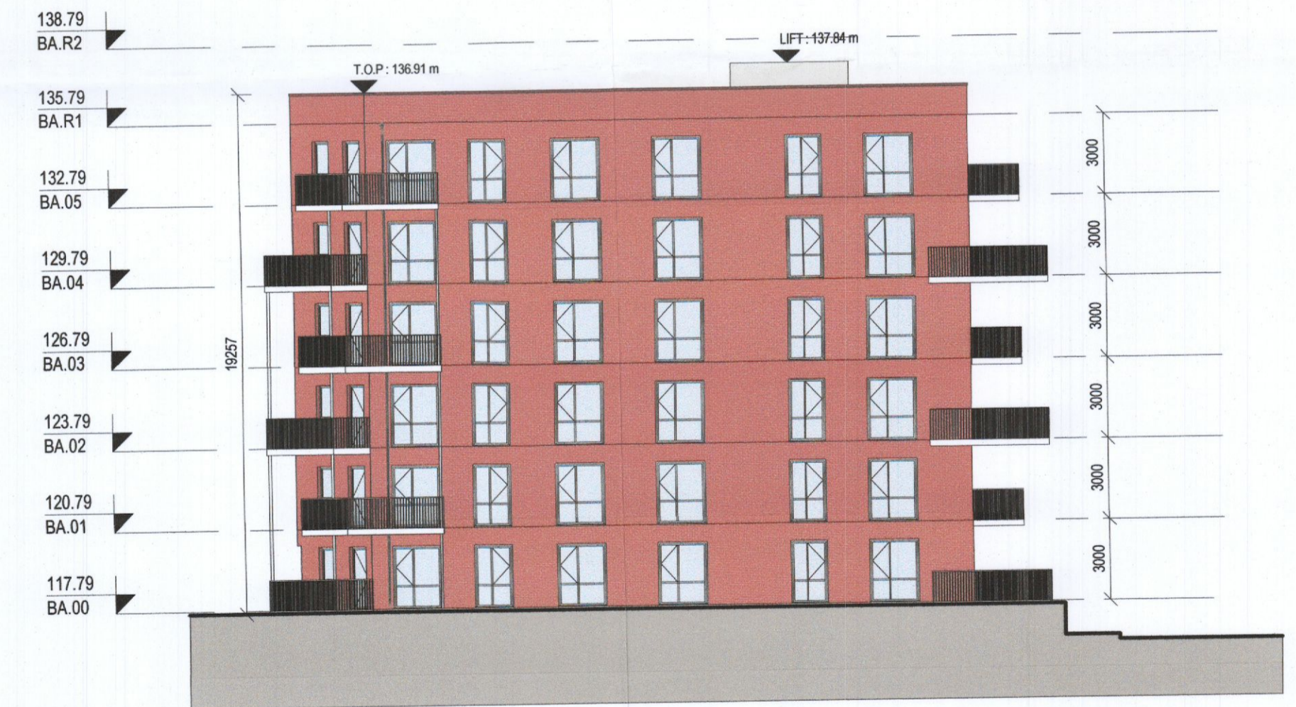
4 PROPOSED - BLOCK A - EAST ELEVATION Scale: 1 : 200