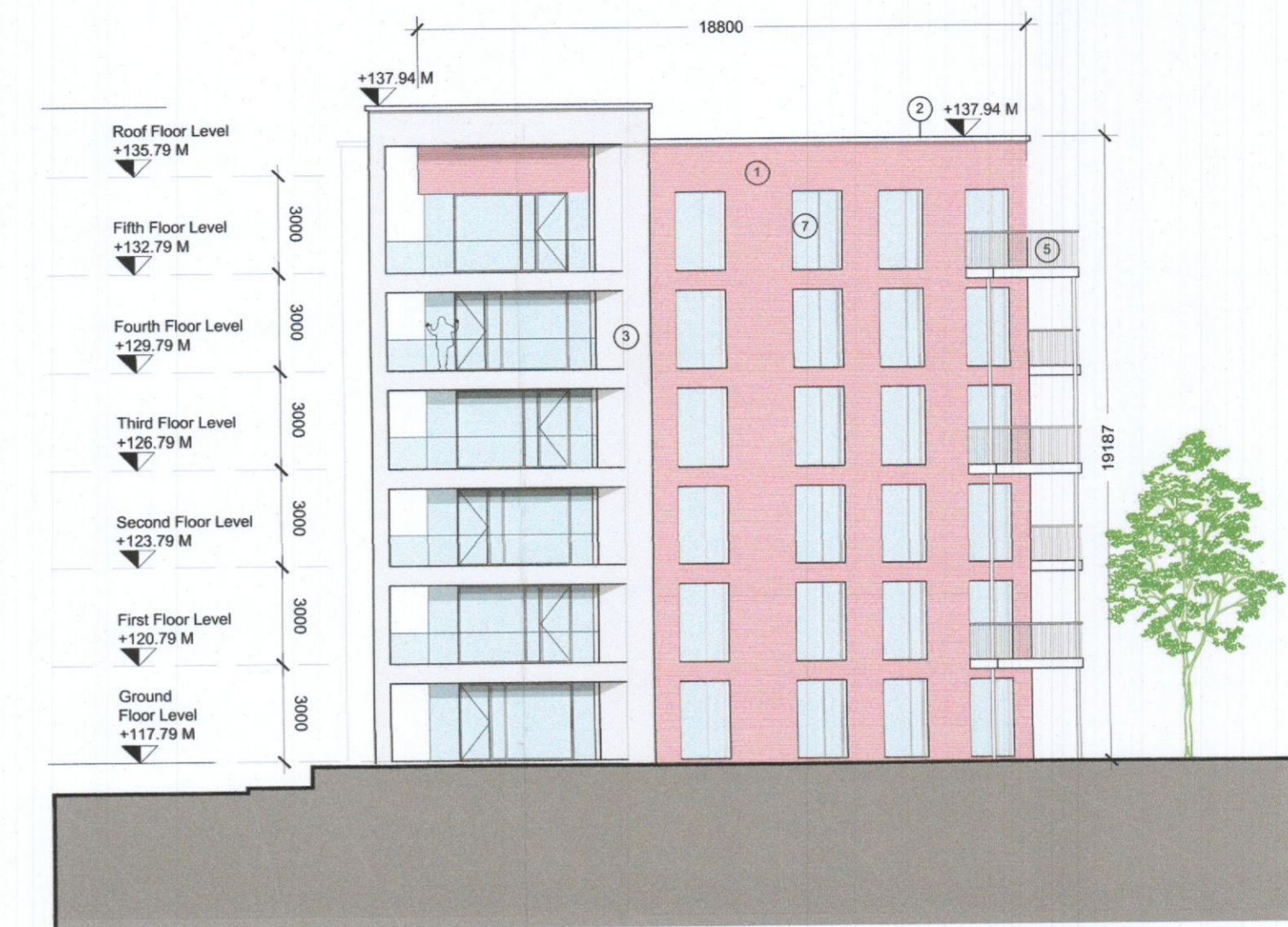
2 EXISTING - BLOCK A - WEST ELEVATION - PLANNING REF ABP-305556-19 Scale: 1 : 200