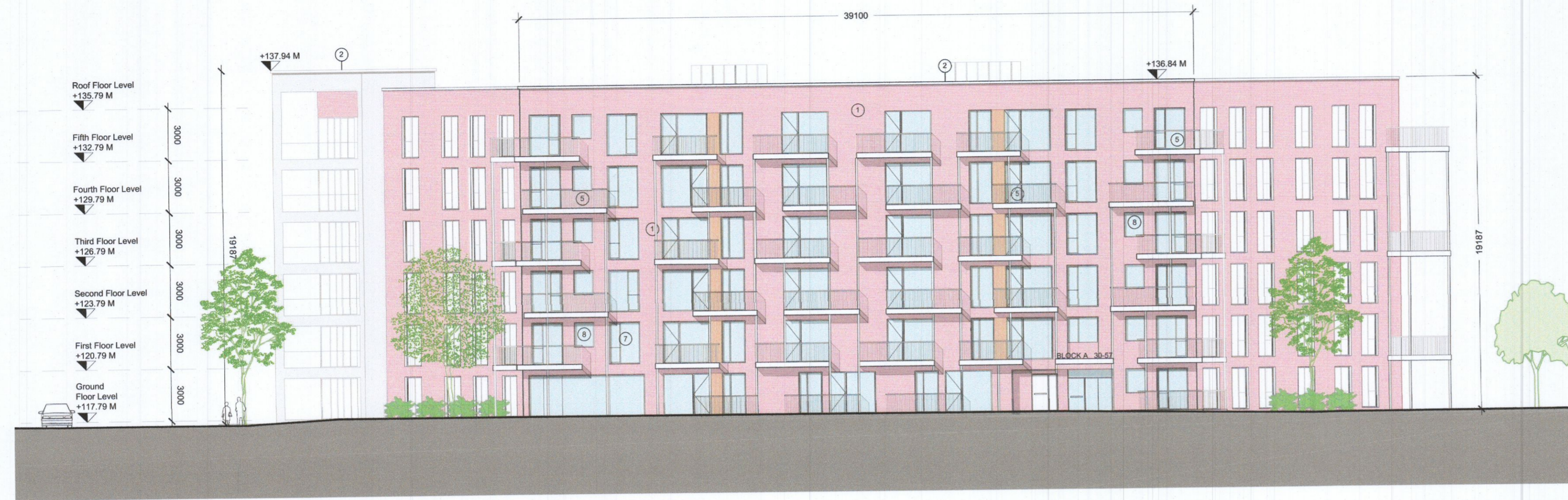
1 EXISTING - BLOCK A - SOUTH ELEVATION - PLANNING REF ABP-305556-19 Scale: 1 : 200