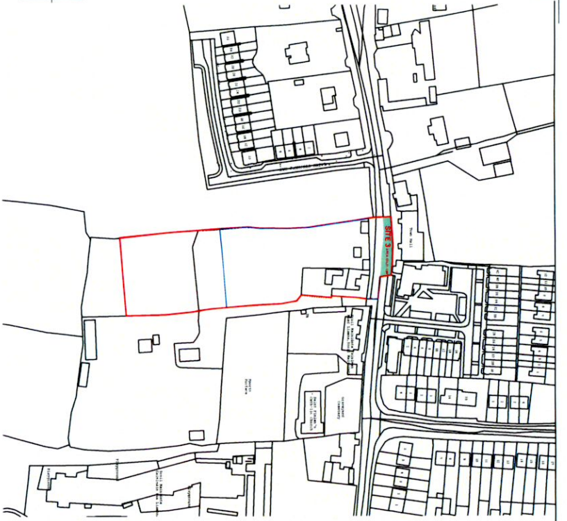
01 Local Map PA000 1:2500

SITE 2 OWNED BY VENDOR SITE 3 OWNED BY SOUTH DUBLIN COUNTY COUNCIL