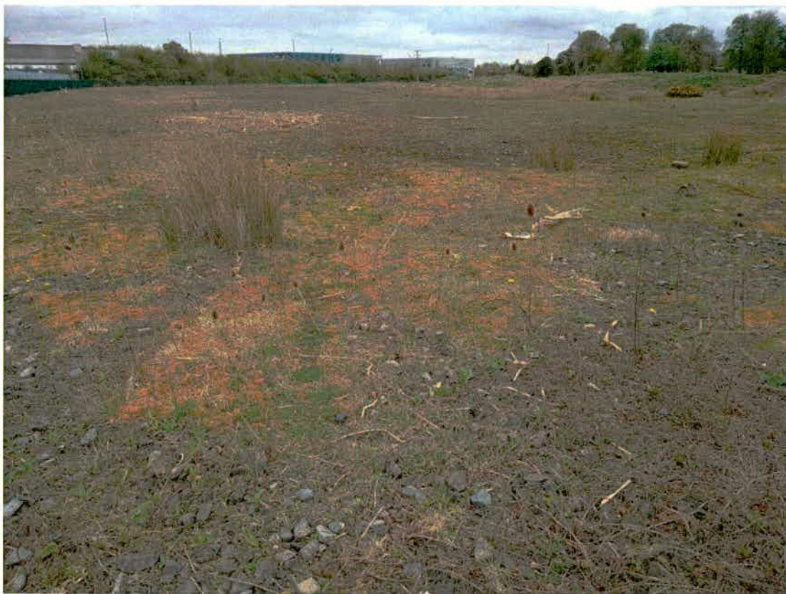
Photo 3. Recolonising bare ground.