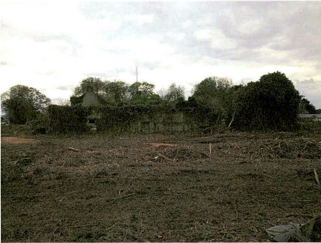
Photo 4. Old stone building without roof in area of recently cleared woodland.