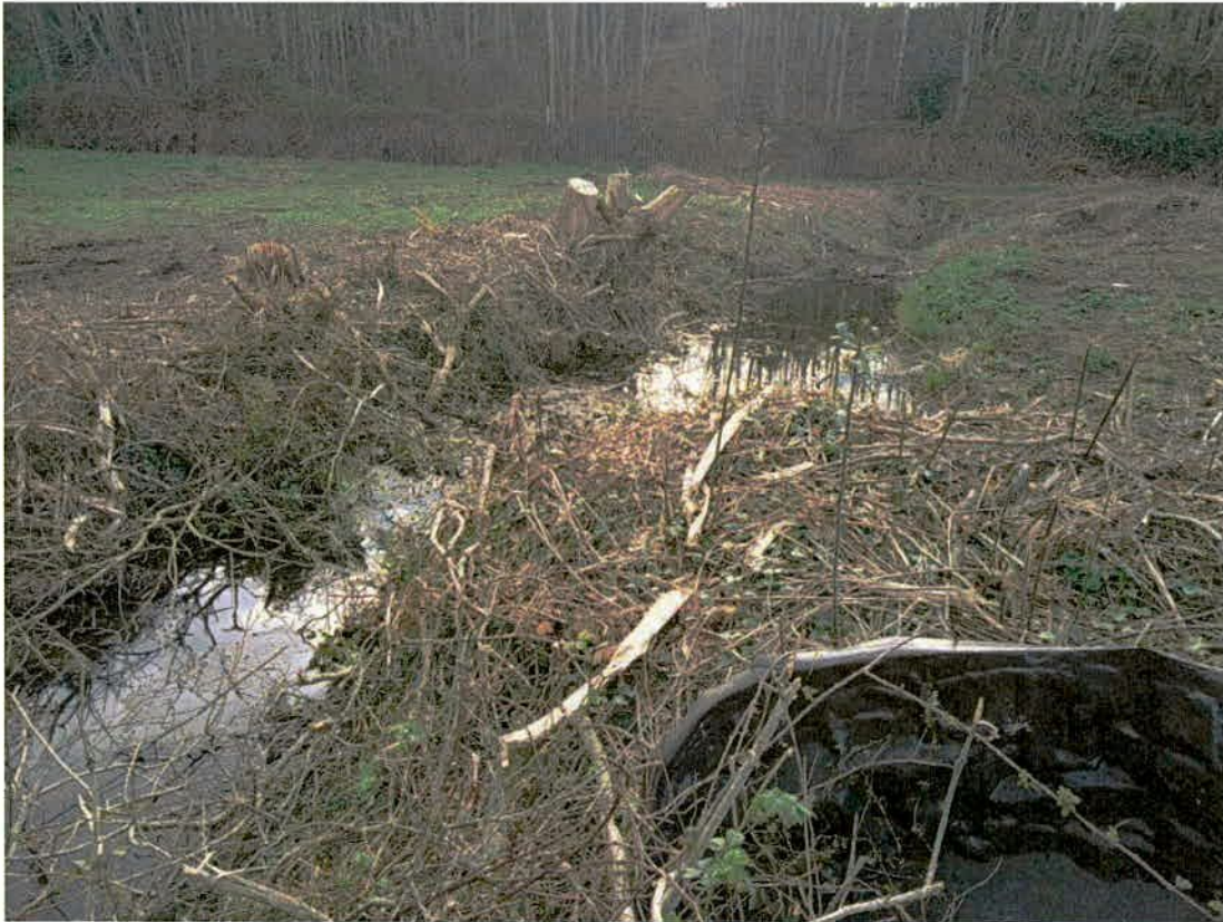
Photo 6. Ditch filled with water at south-western end of site.