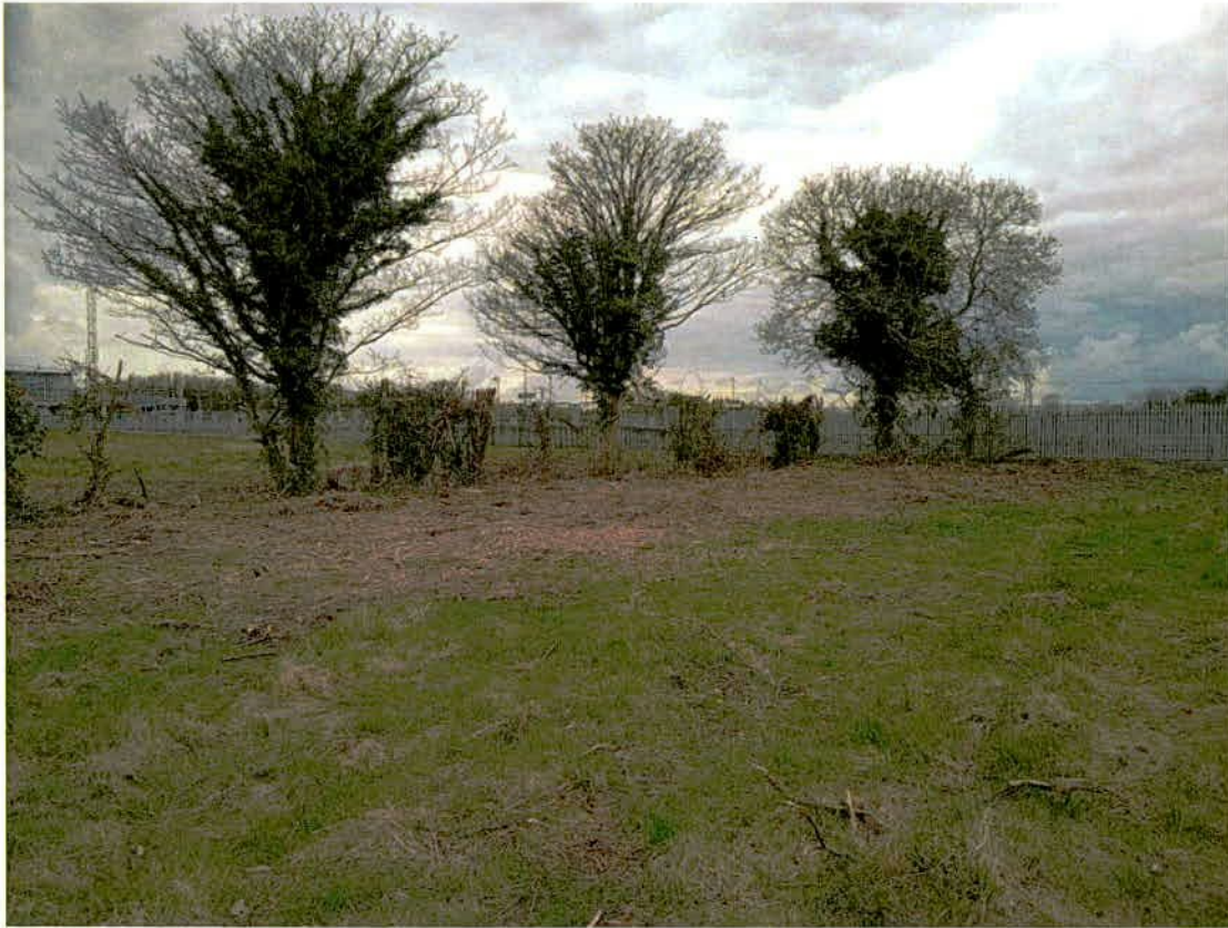
Photo 2. Northern edge of H1 showing cleared scrub and severely pruned back hedge.