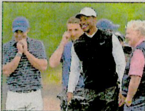
LEGENDS ... Rory, Tiger and Jack Nicklaus yesterday

"St Andrews this time will feel like the defence I never had. And then, hopefully, I'll be defending at Royal Liverpool in 2023."