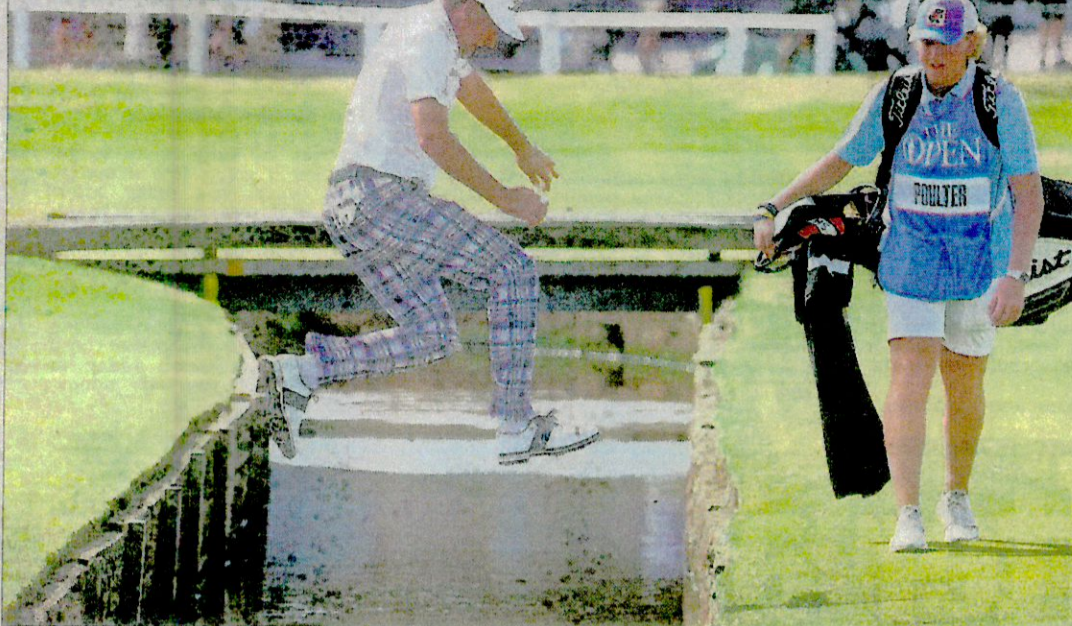
IAN POULTER just loves to LIV dangerously — as he takes on this daring leap at St Andrews. The Englishman has controversially hopped it on to Saudi Arabia's megabucks rebel tour. And he caused another stir yesterday by jumping over the Swilcan Burn on the first hole of the Old Course. Looks like Poulter must have burned his bridges...