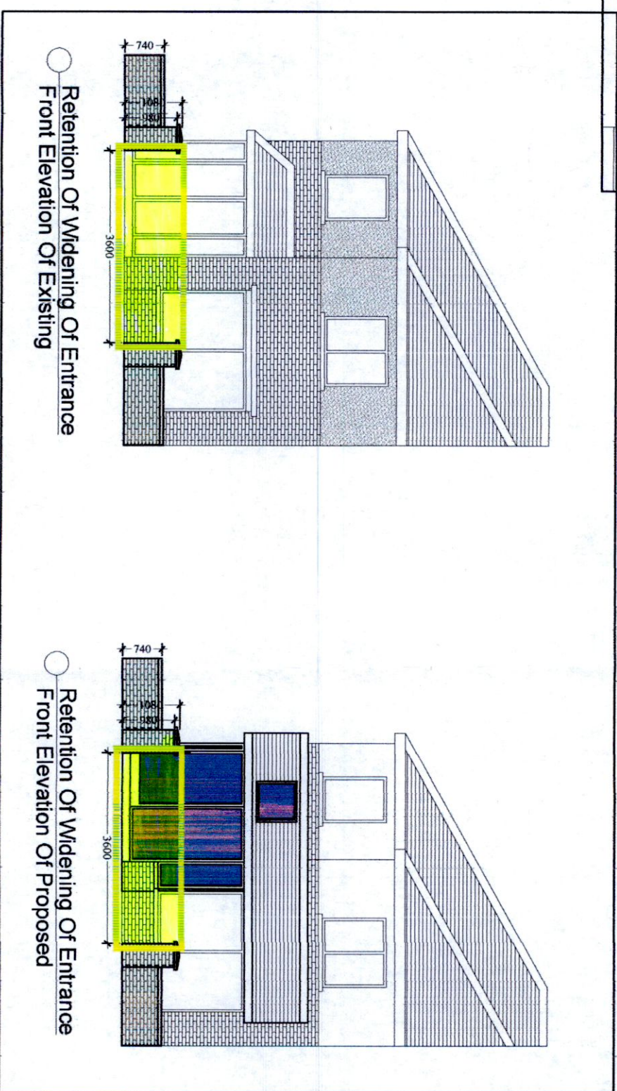
Retention Of Widening Of Entrance