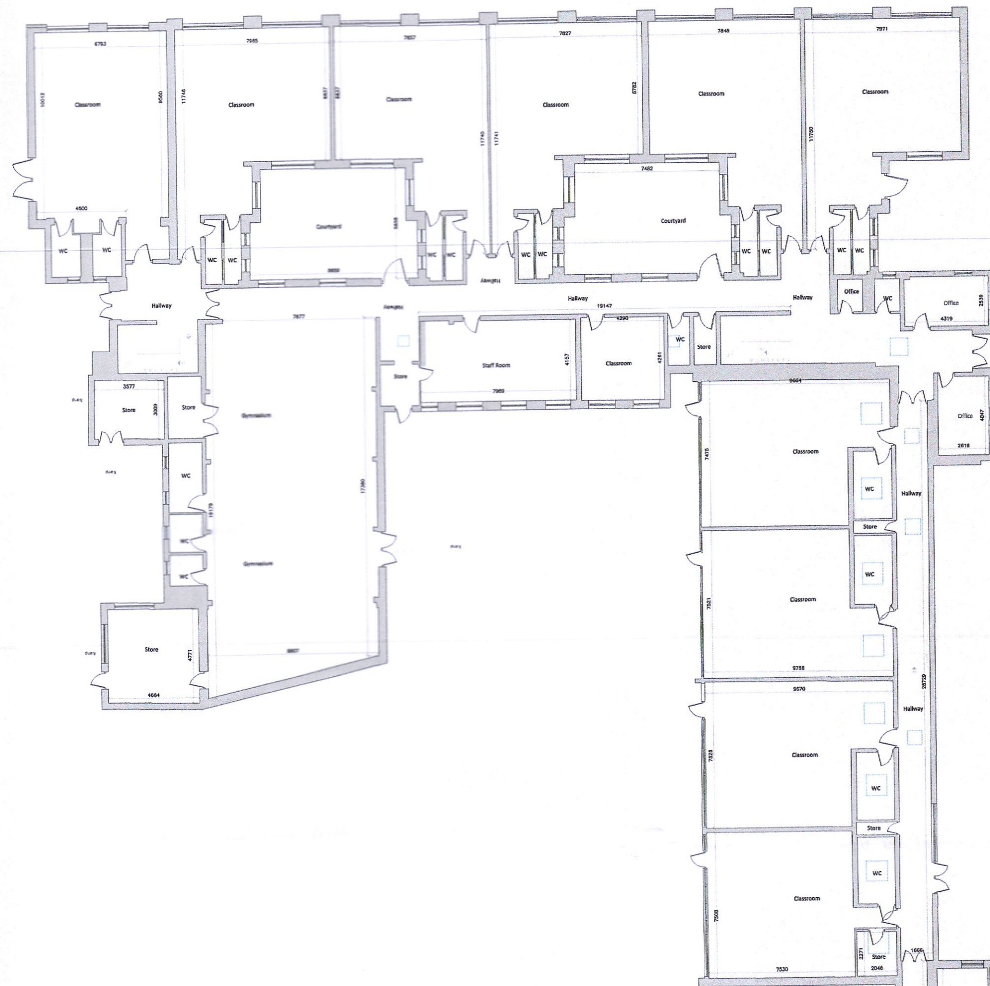
PROPOSED GROUND FLOOR