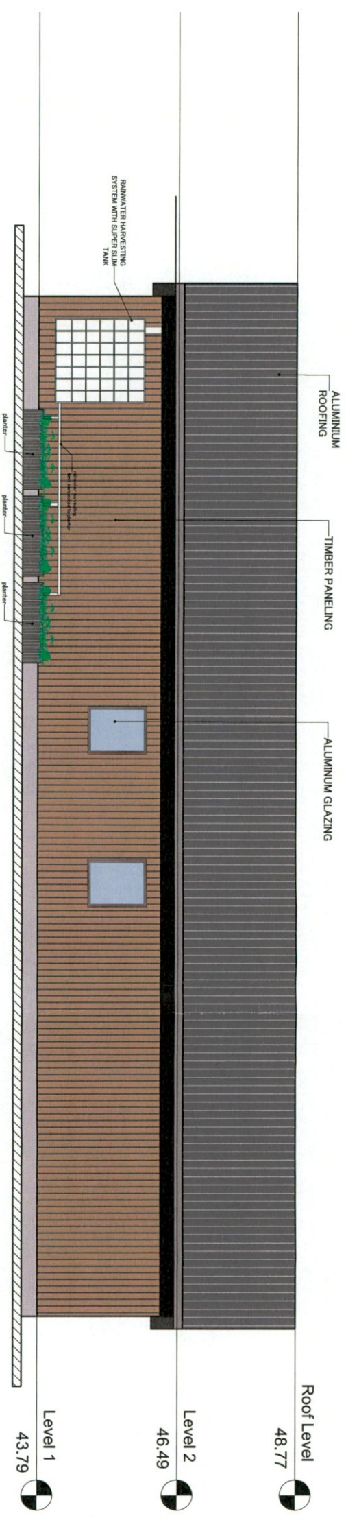
REAR ELEVATION SHOWING LOCATION OF RAINWATER HARVESTING UNIT

In the event of any discrepancies between drawings, the contractor is to inform the Architect immediately.