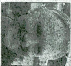
SCHMIDT... rushed in