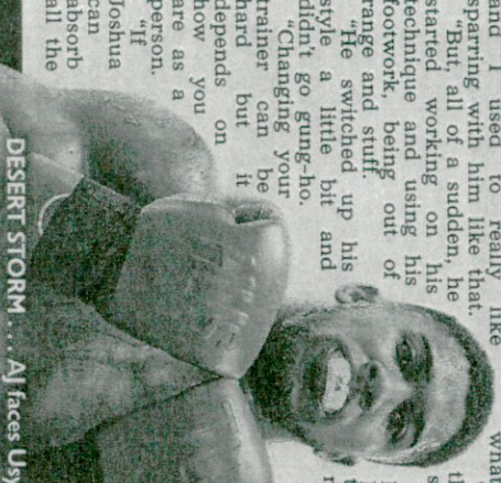
DESERT STORM . . . AJ faces Usyk in Saudi

Tickets for Joyce vs Hammer are on sale at ASX.com and Ticketmaster.co.uk from 55p.