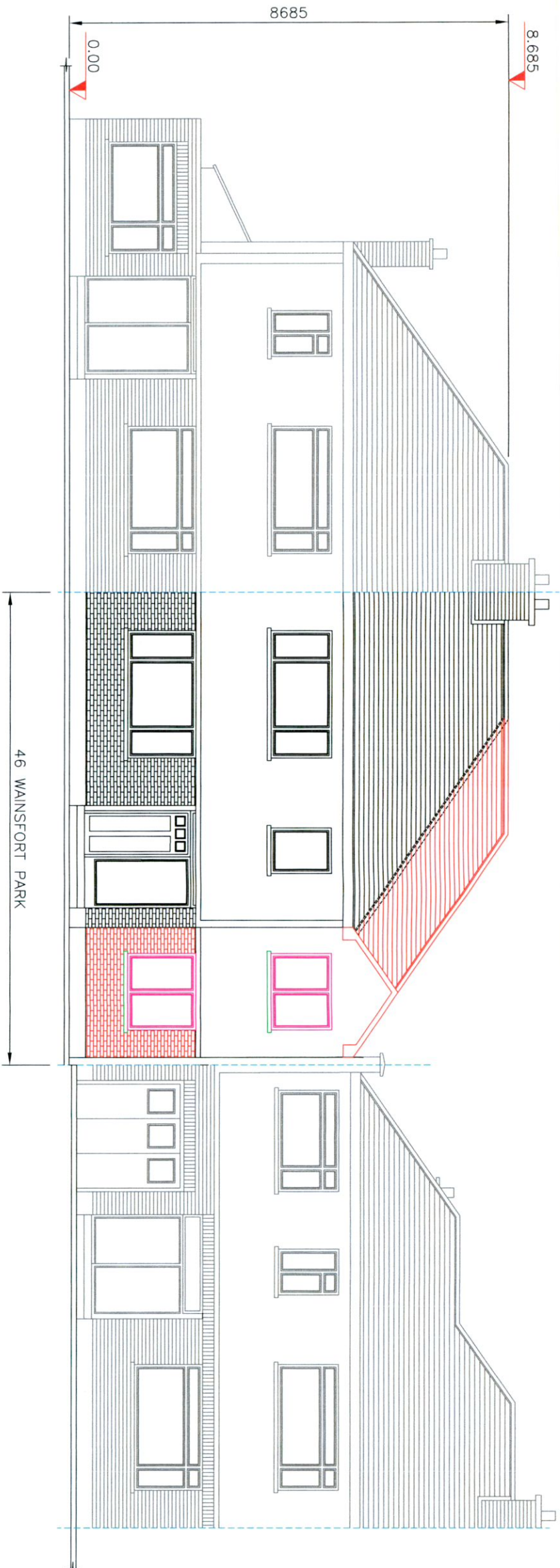
PROPOSED FRONT ELEVATION - CONTIGUOUS