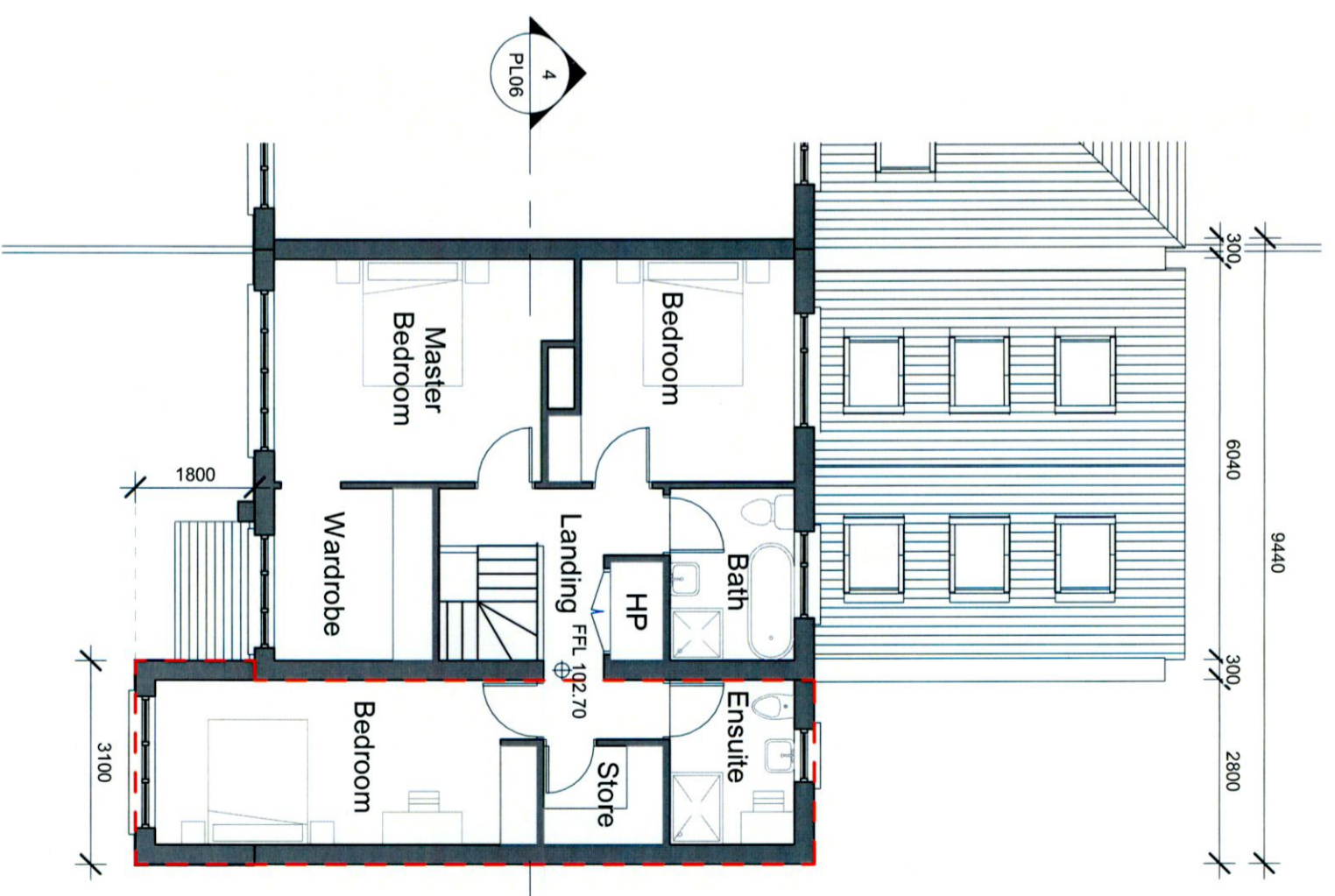
2 First Floor - Proposed 1 : 100