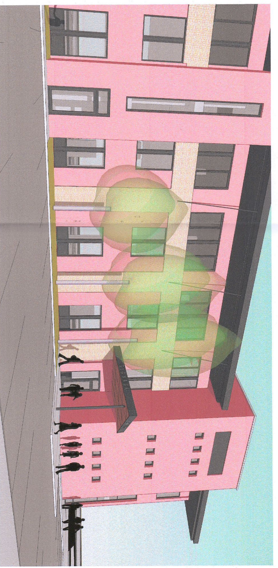
3 202 1:200 PROPOSED CONCEPT VIEW - LOOKING SOUTH EAST