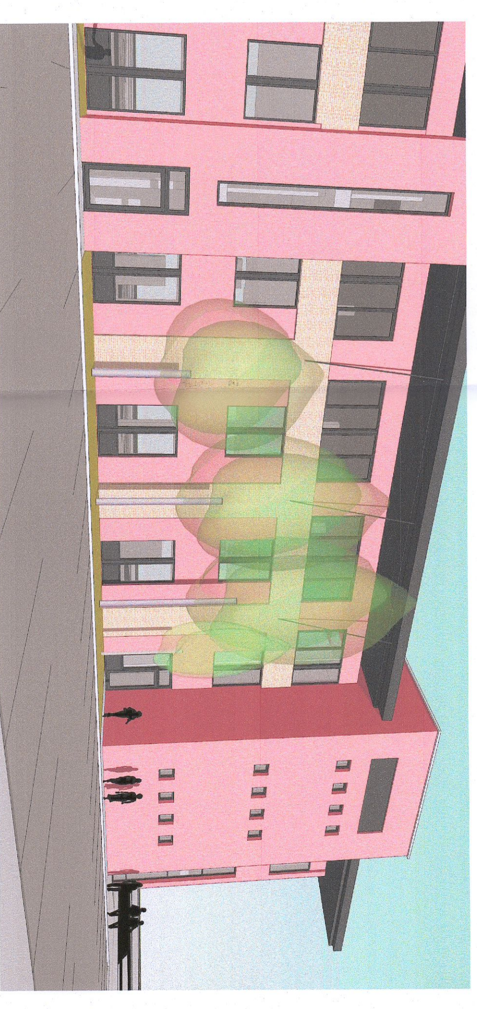
3 201 1:200 EXISTING CONCEPT VIEW - LOOKING SOUTH EAST