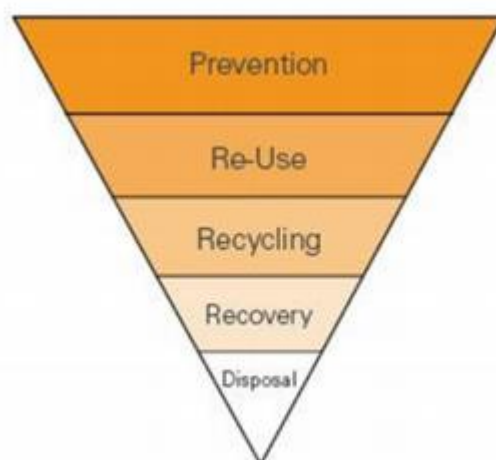
Figure 8.1 EU Waste Management Hierarchy.

The on-site handling of waste will be carried out in accordance with the Waste Management Hierarchy, as set out in Article 4 of the Waste Framework Directive (2008/98/EC) and transposed into Irish law via Section 21A of the Waste Management Act. The Waste Management Hierarchy outlines that waste prevention and minimisation are the first priority in managing wastes, followed by waste reuse and recycling with disposal being considered as a last resort. The EU Waste Directive (2008/98/EC) also mandates that hazardous waste generation should be avoided or at least minimised.