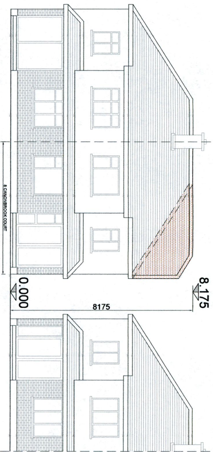
Contiguous Proposed Front Elevation