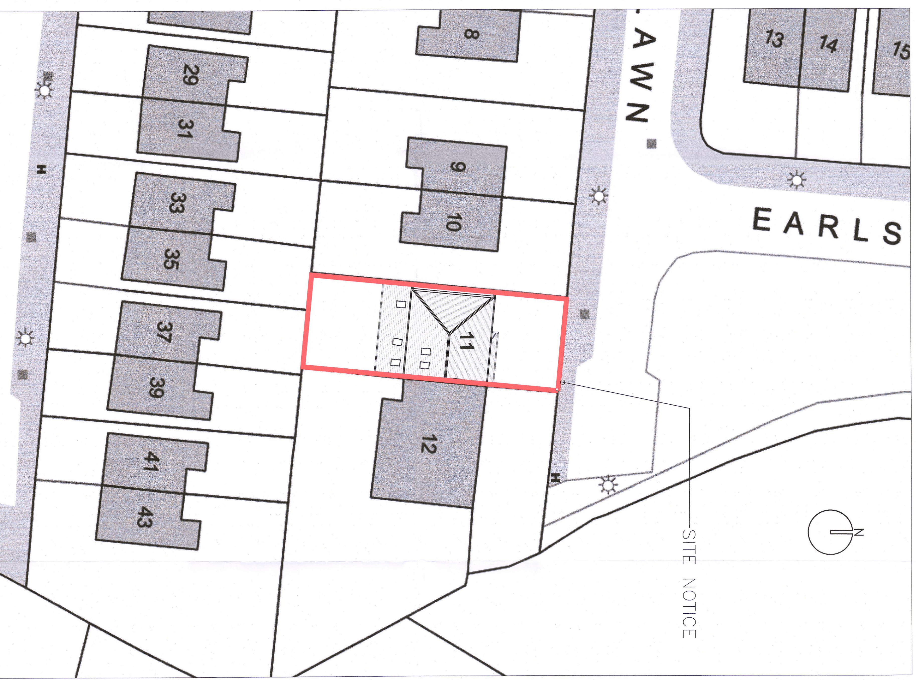
SITE LAYOUT PLAN SCALE: 1:200

COPYRIGHT The design and details shown on this drawing are applicable to this project and are the property of the Architect. No part of this drawing may be reproduced, stored in a retrieval system, or transmitted in any form or by any means, electronic, mechanical, photocopying, recording, or by any information storage and retrieval system, without written permission of the Architect. All rights reserved. DO NOT SCALE FROM THIS DRAWING Use given dimensions. Contractor to check all dimensions on site prior to commencement of Works. Any discrepancies are to be reported to the Architect.