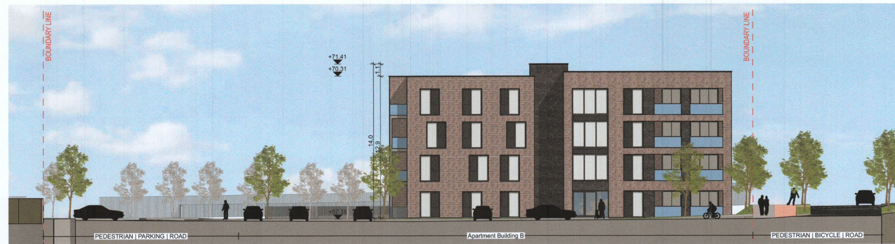
C Section SCALE 1:200