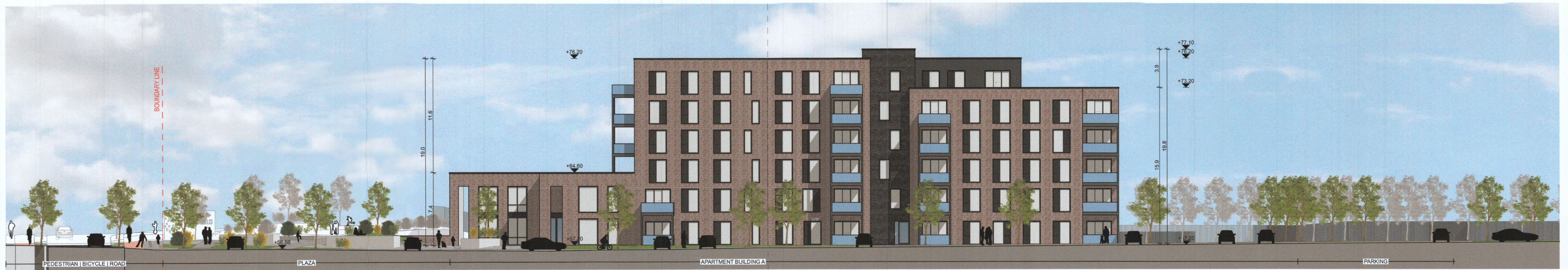
B Section SCALE 1:200