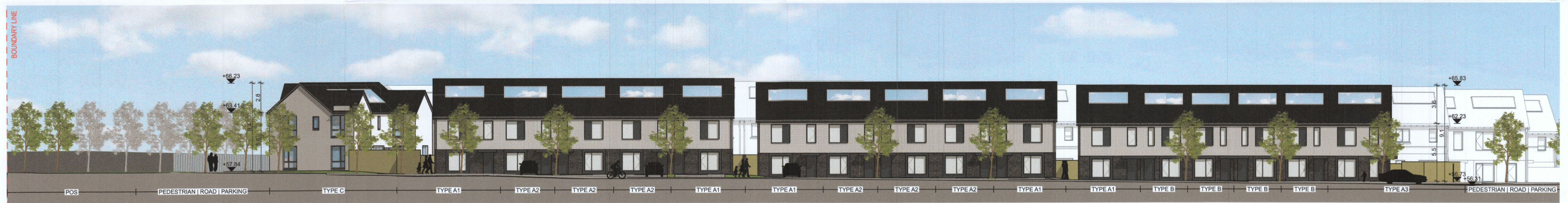
D Section SCALE 1:200