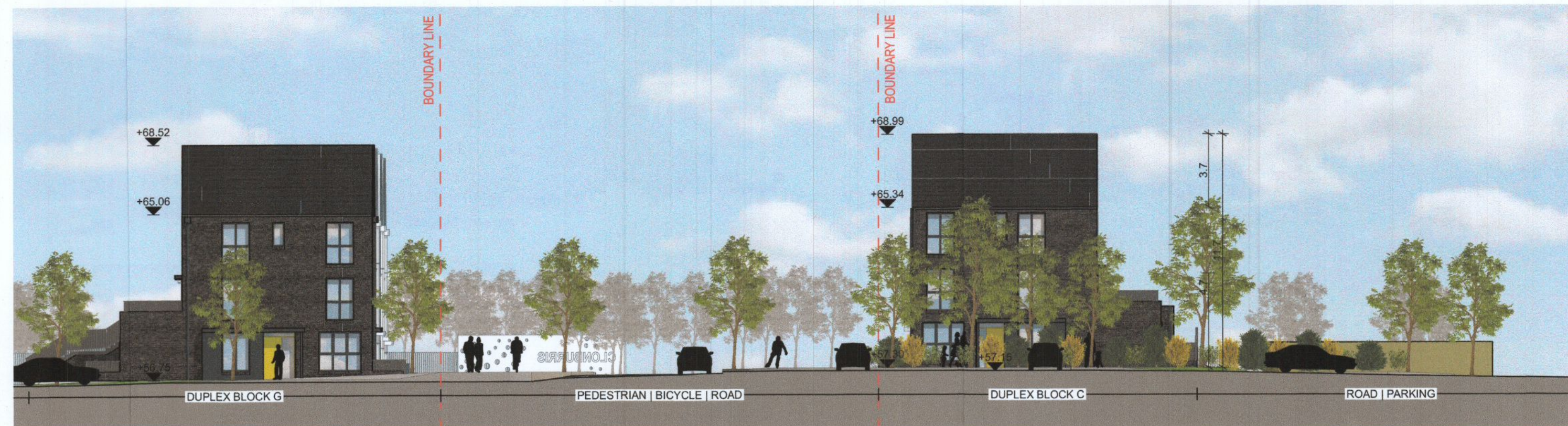
E Section SCALE 1:200