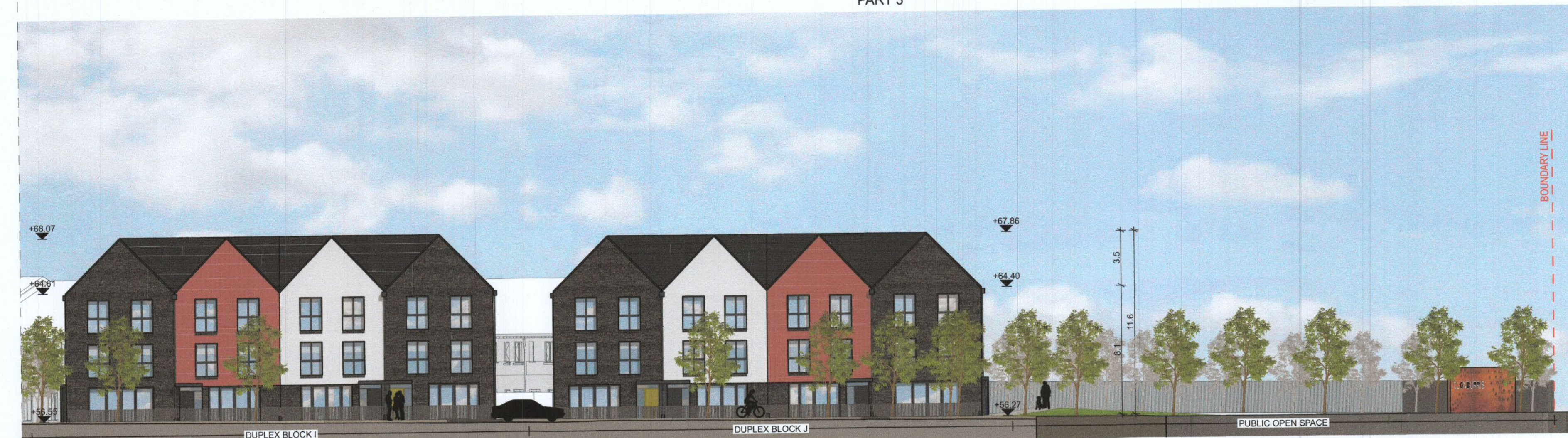
B Section SCALE 1:200