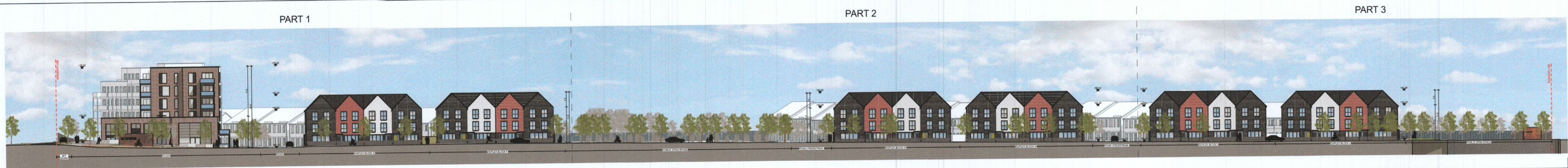
A Section SCALE 1:500