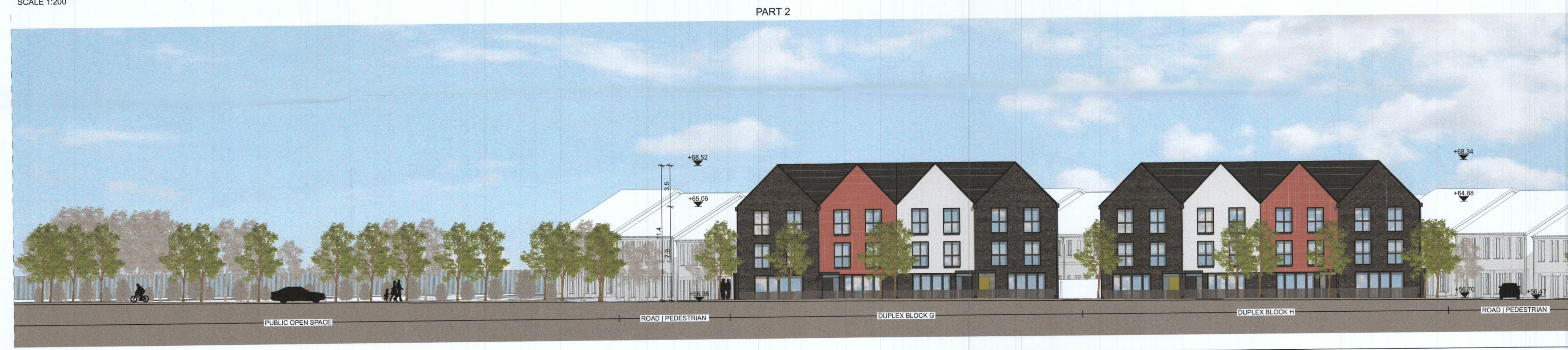
A Section SCALE 1:200