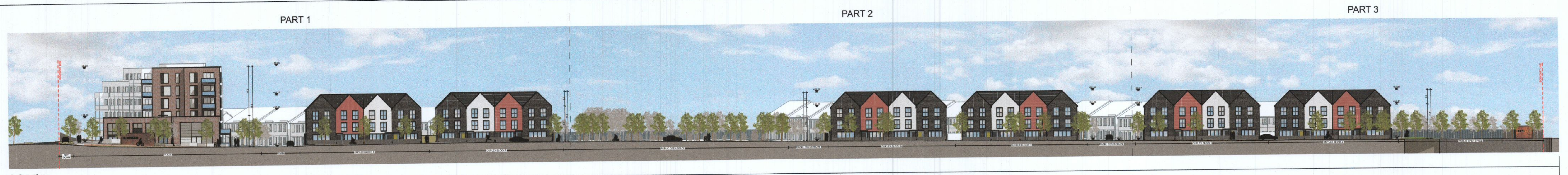
A Section SCALE 1:500