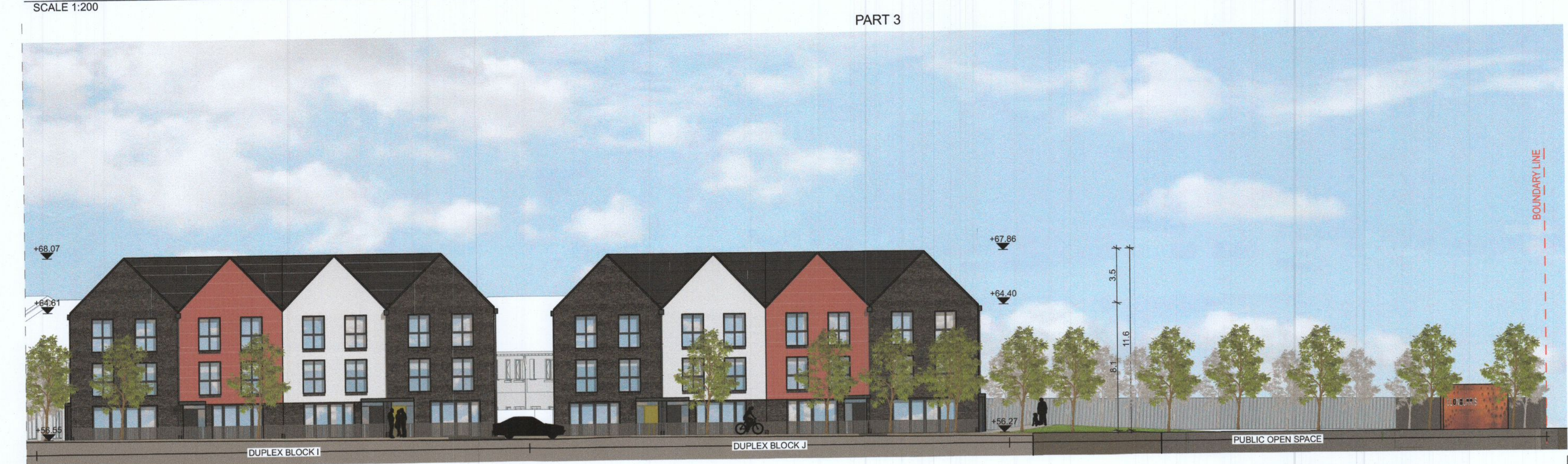
B Section SCALE 1:200