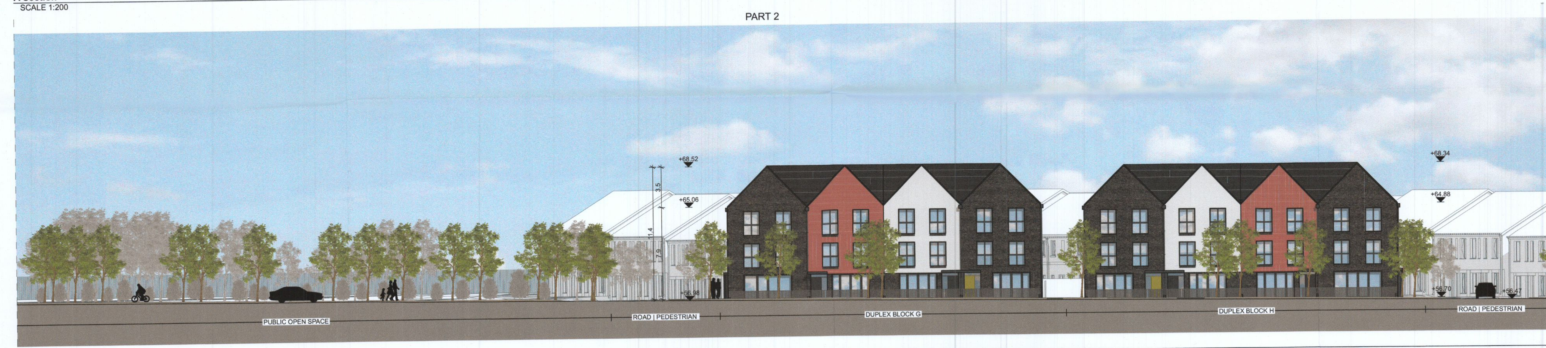
A Section SCALE 1:200