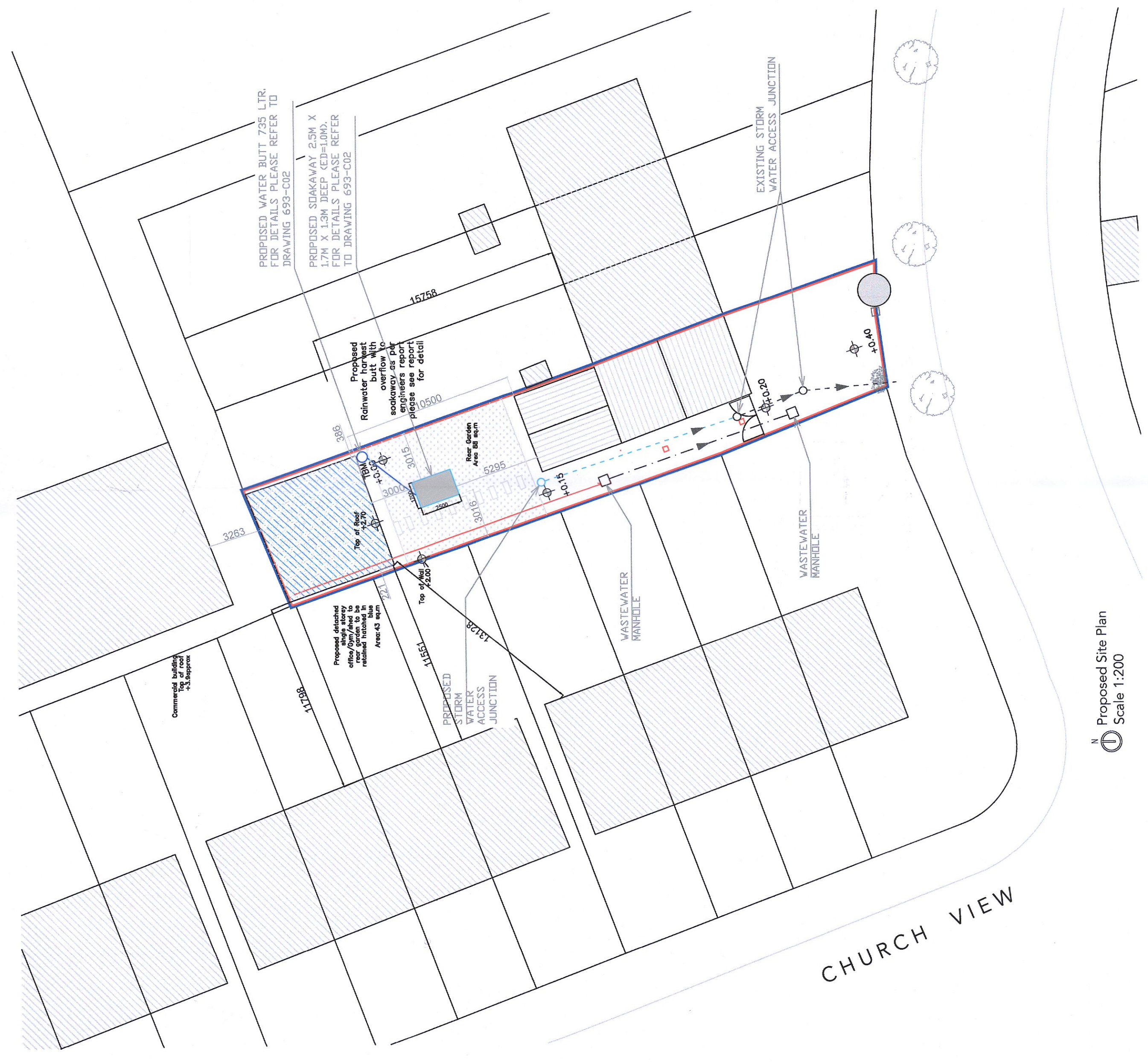
Proposed Site Plan Scale 1:200