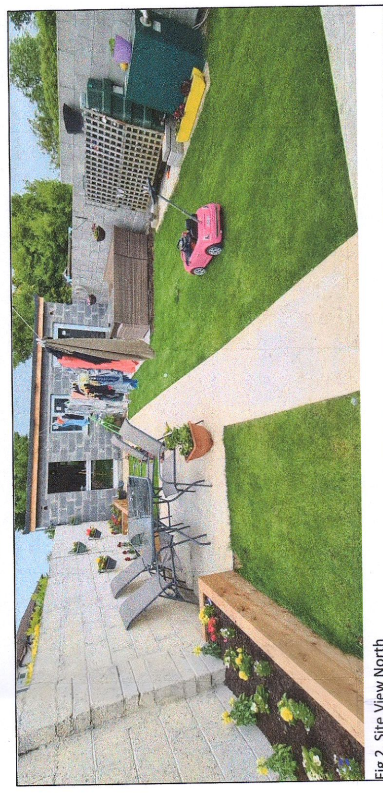
Fig 2. Site View North