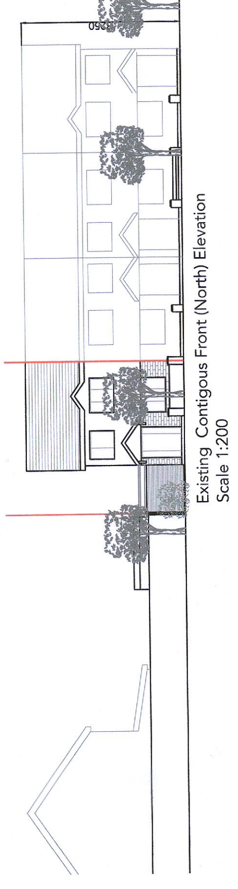
Existing Contiguous Front (North) Elevation Scale 1:200