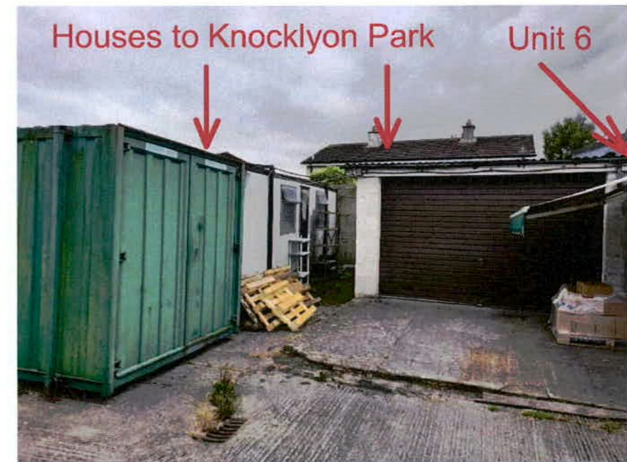
Views of neighbouring bushes from yard to existing storage units- eye level 1.6m

Notes This drawing and designs remains copyright to Gilna Architecture - all rights reserved. All Dimensions to be checked on site. No Dimensions to be scaled from the drawing. All Discrepancies to be notified to the Architect. All Work to be carried out in accordance with the Building Regulations and Relevant Codes of Practice. All dimensions to face of blockwork unless otherwise noted. This drawing to be read in conjunction with specification and consultants drawing.