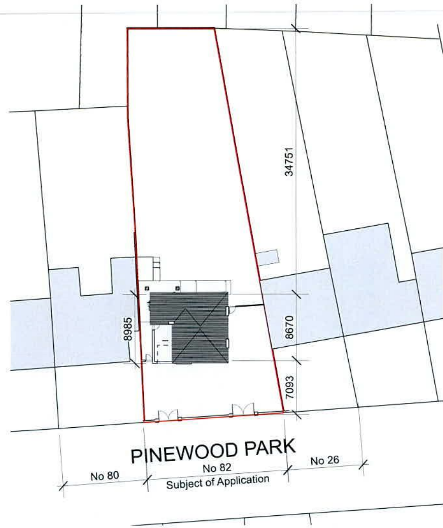
1 Existing Site Plan Scale: 1:500