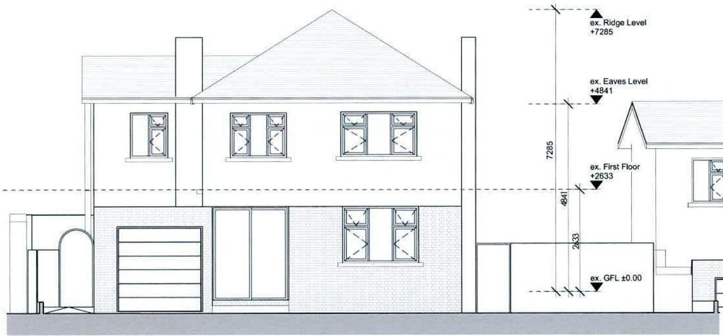
1 Existing Front Elevation Scale: 1:100