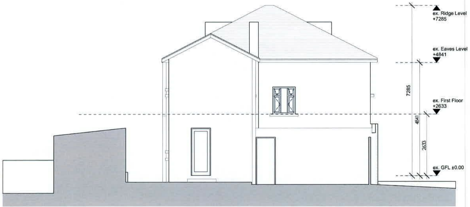
1 Existing Side Elevation (South) Scale: 1:100