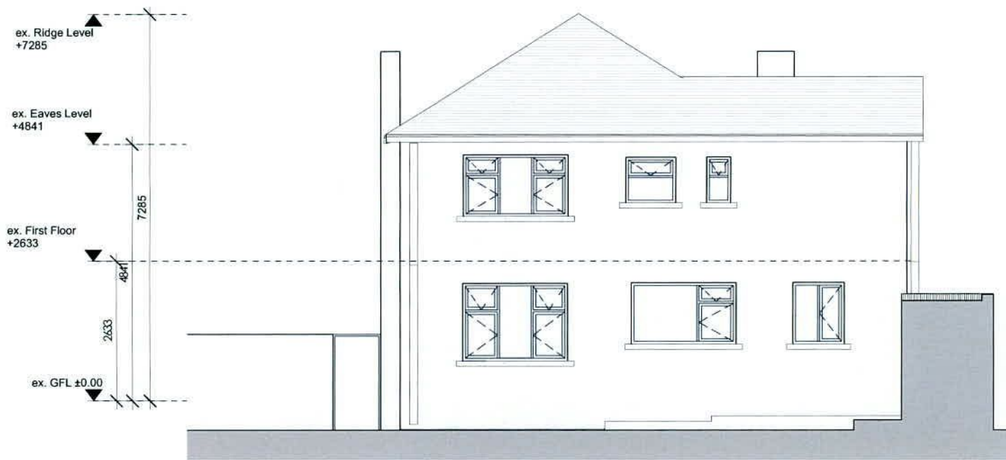
2 Existing Rear Elevation Scale: 1:100