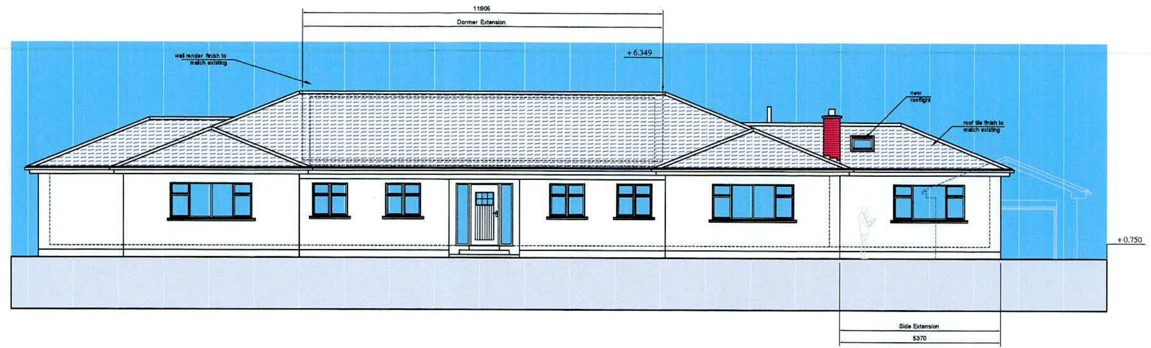
Front Elevation -- Proposed Scale: 1/125