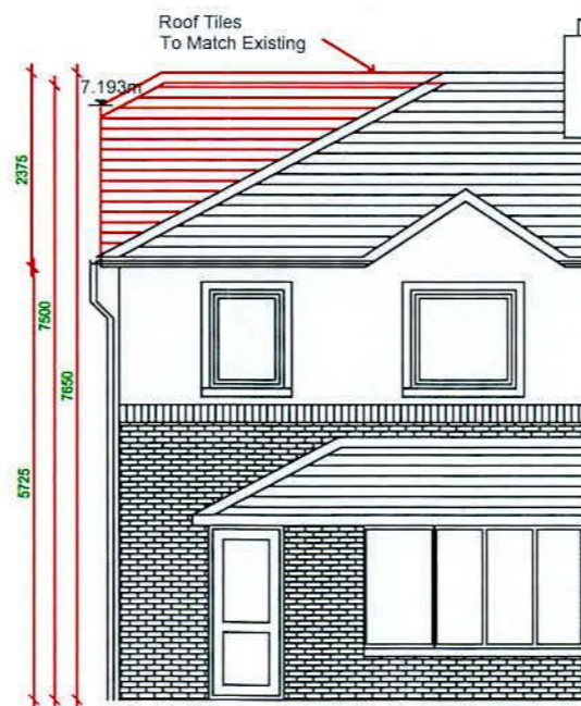
12 Moy Glas Way Proposed Front Elevation