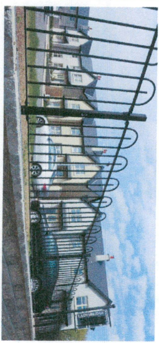
VIEW TIRD TYPICAL RAILING