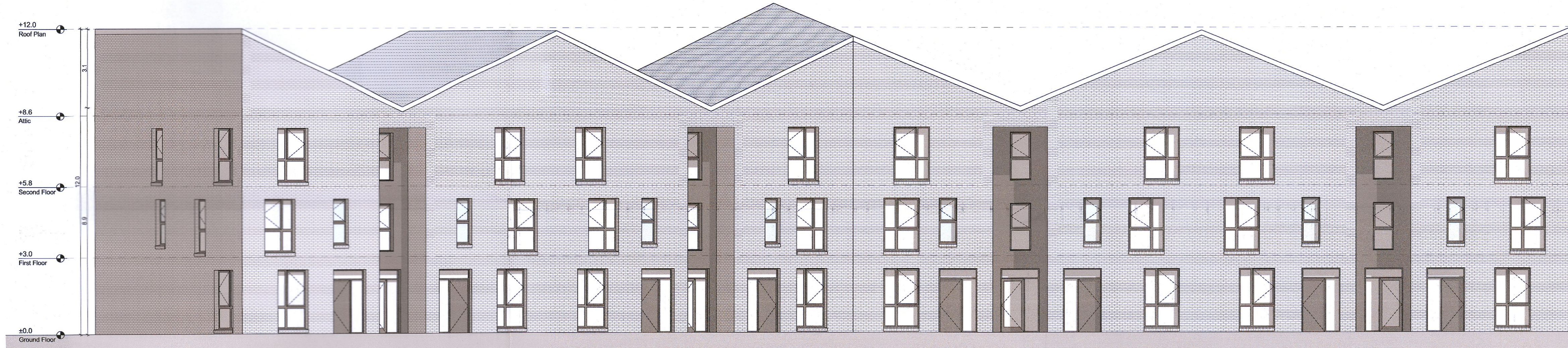
Entrance 2 Elevation