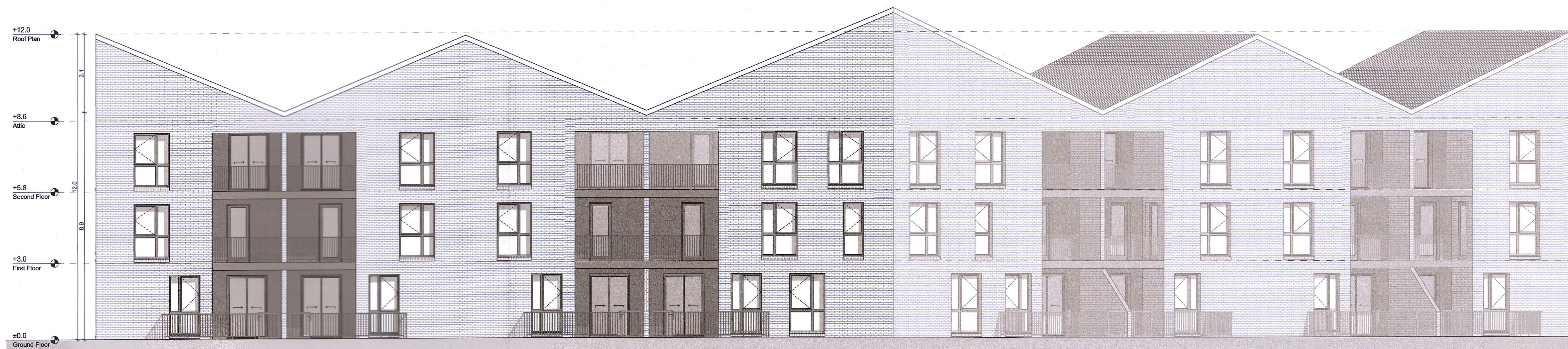
Back 1 Elevation

Notes Do not scale from this drawing. Use figured dimensions only. All errors and omissions to be reported to the Architect. This drawing is to be read in conjunction with relevant consultant's drawings. All dimensions are in millimetres and all levels are in meters to match Datums unless otherwise noted. This drawing is for planning purposes only and not for construction. This drawing or design may not be reproduced without permission.