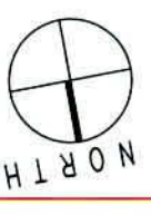
EXISTING FIRST FLOOR PLAN scale 1:75 @ A3