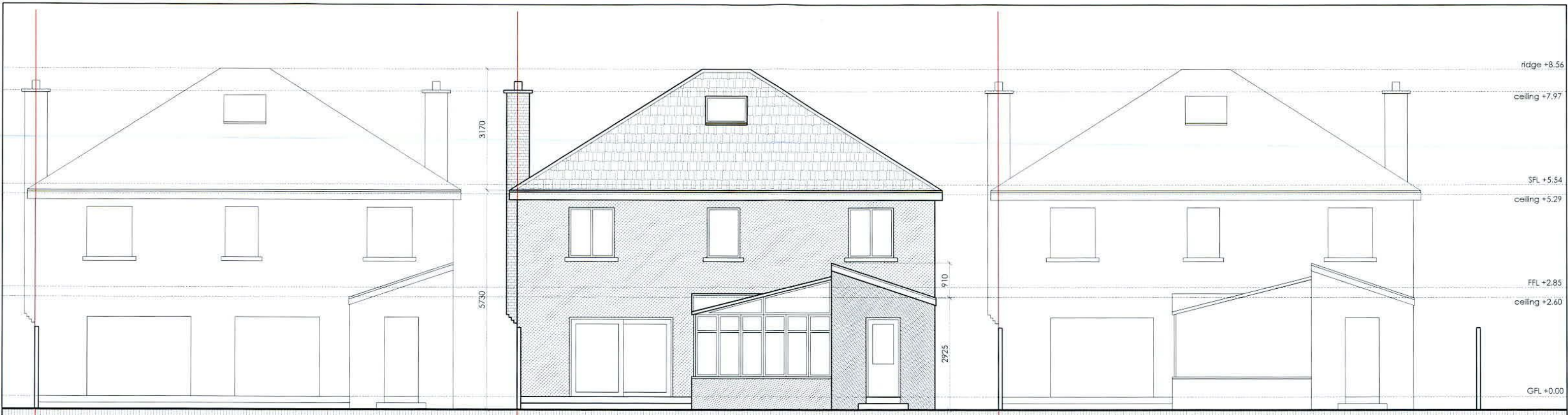
EXISTING REAR ELEVATION (E) scale 1:100 @ A3