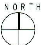
EXISTING SITE PLAN [LICENCE NO: 50274371 MAP REFERENCE: 3391-04, DN022, x714780 y728843] scale 1:250 @ A3

DRAINAGE SUBJECT TO SITE INVESTIGATION AND IN ACCORDANCE WITH LOCAL AUTHORITY