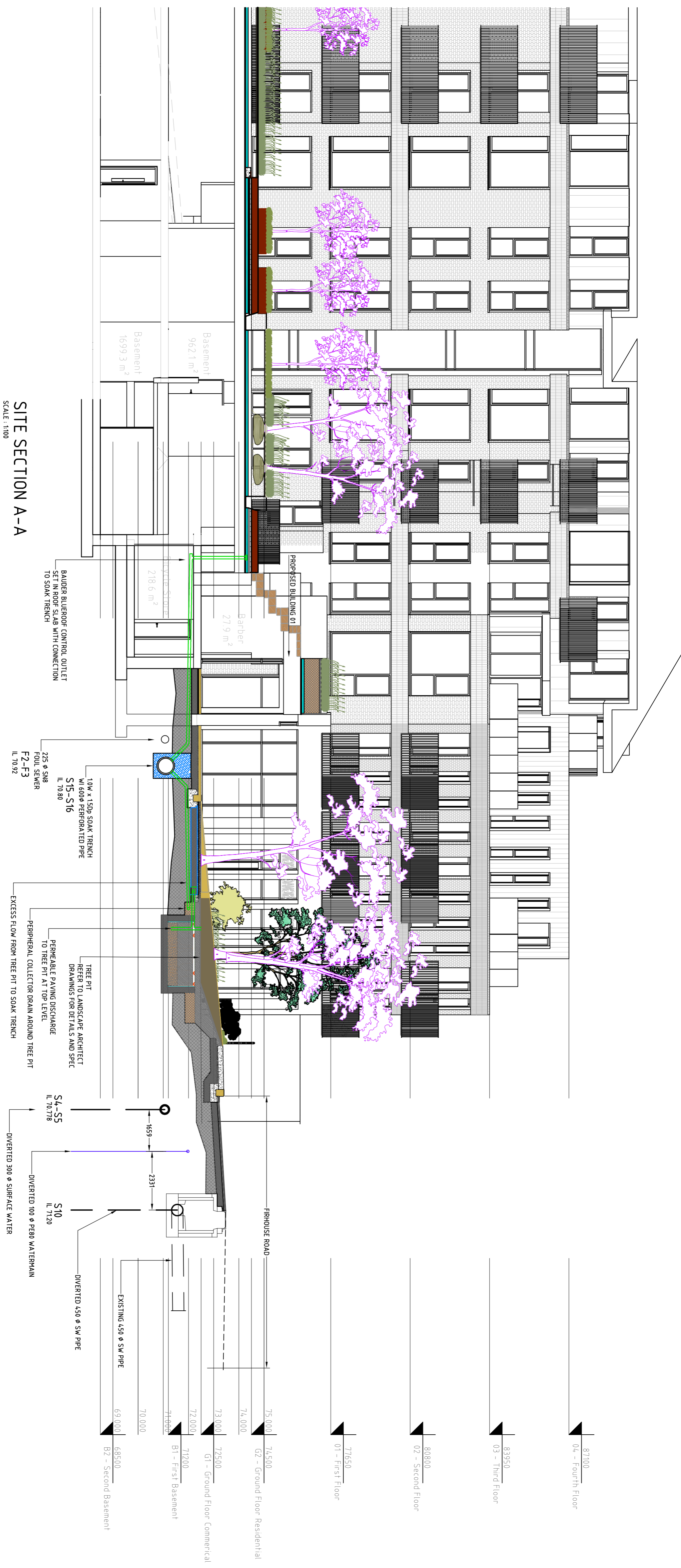
SITE SECTION A-A SCALE: 1:100