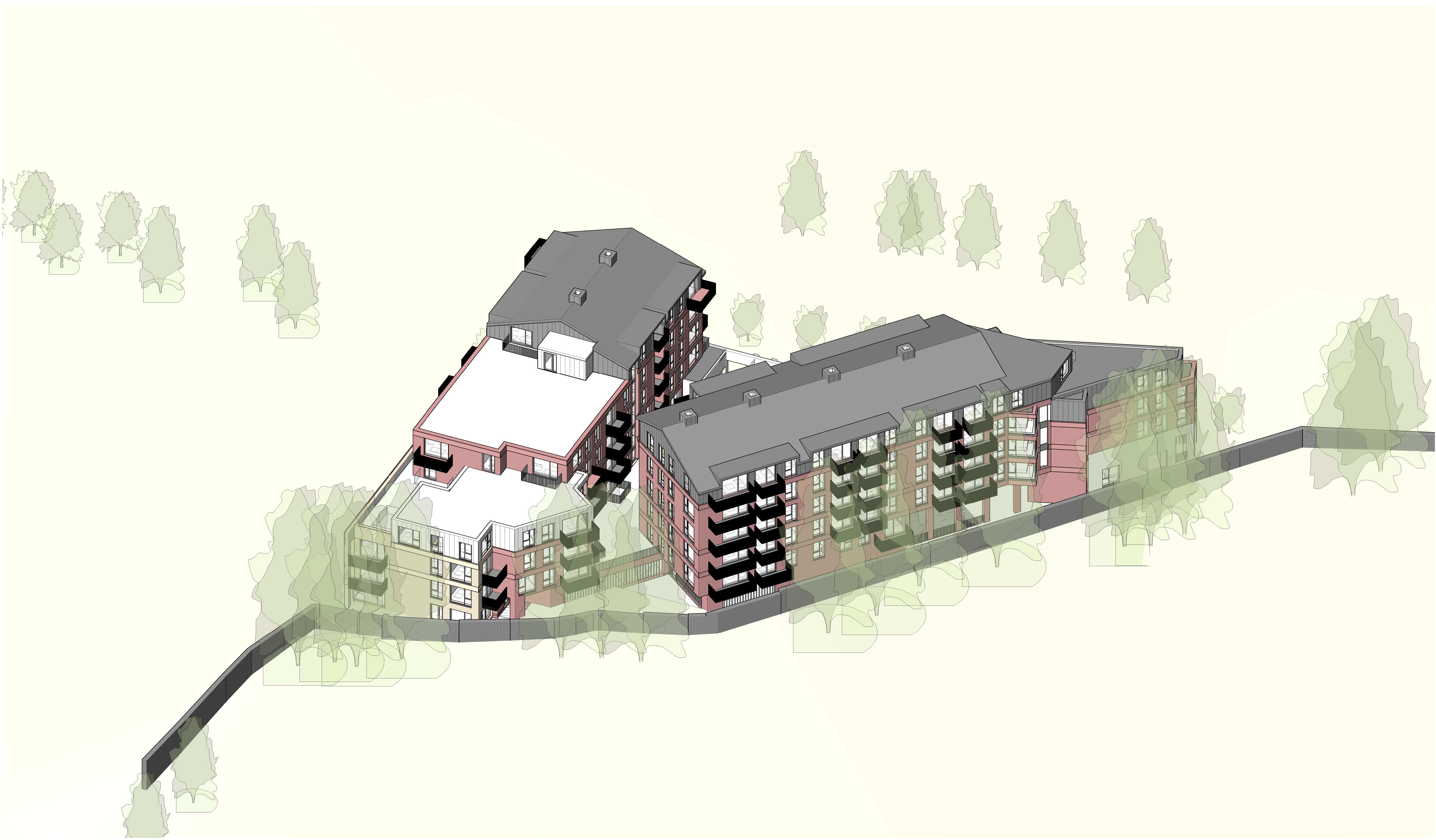
Proposed 3D View - North West