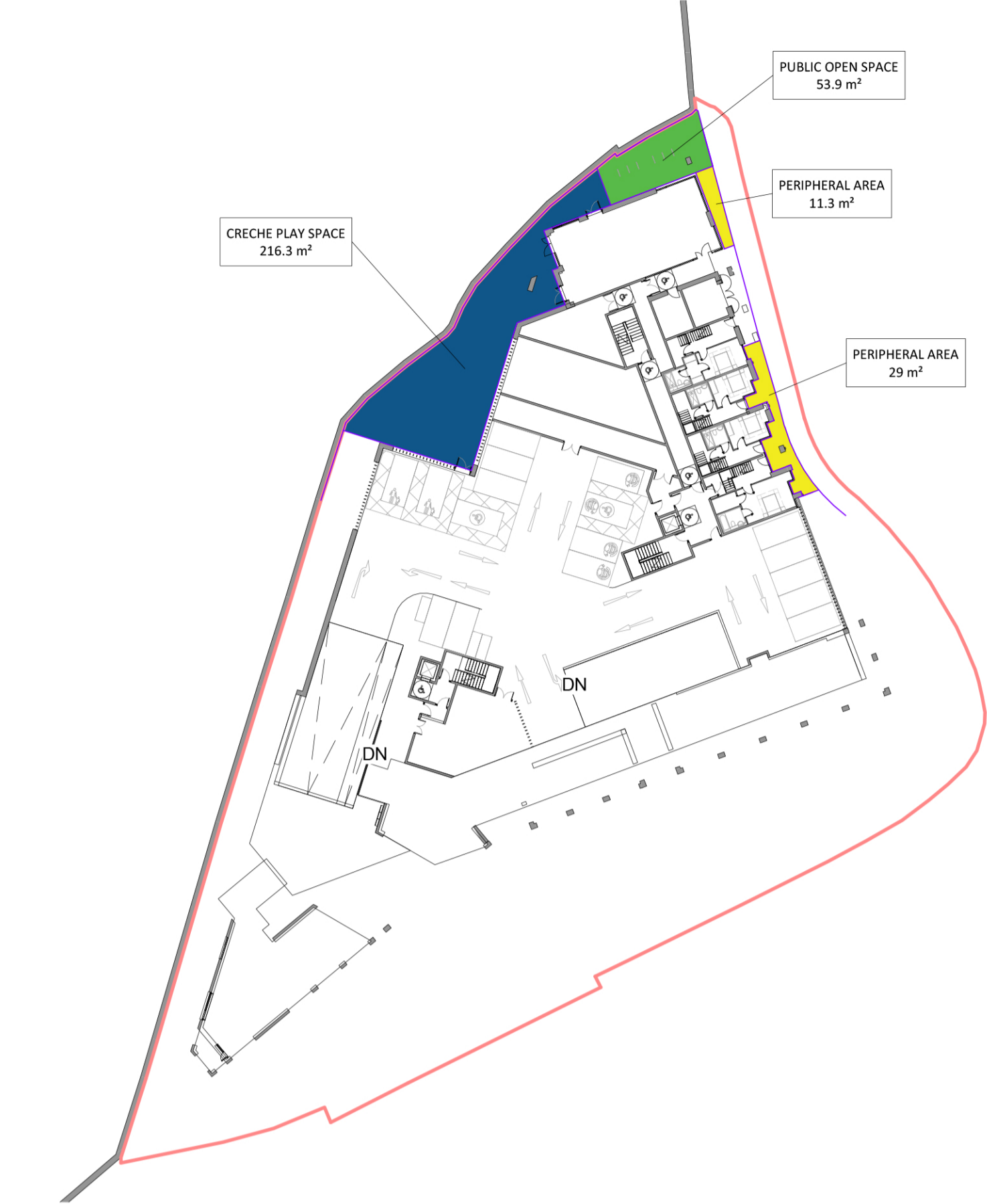
7 B1 - Quantum Open Space 1:500