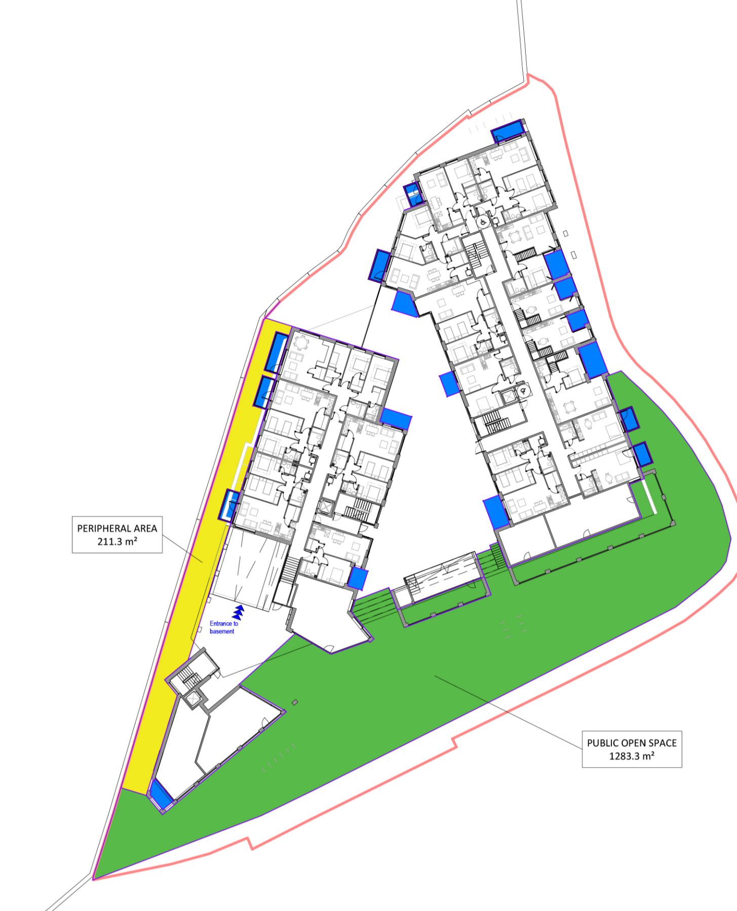
2 G2 - Quantum Open Space 1:500