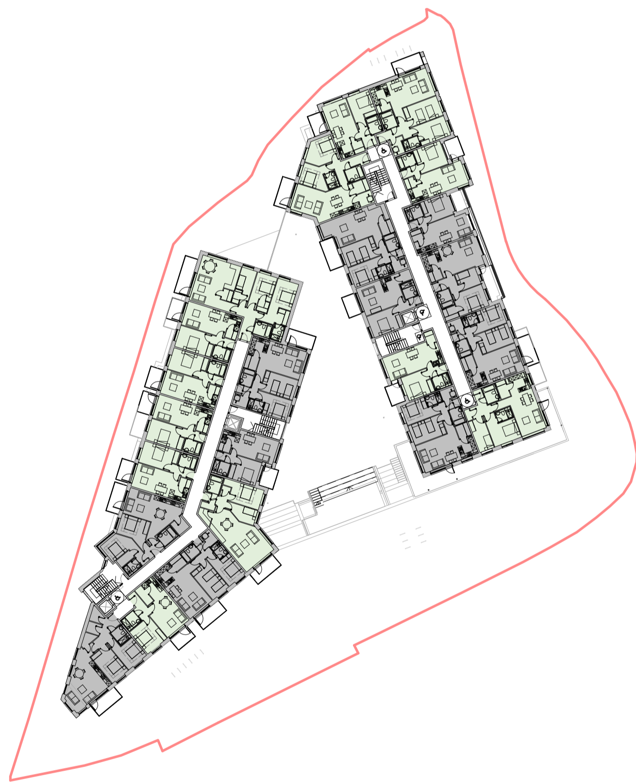
2 SHS-01 1:500