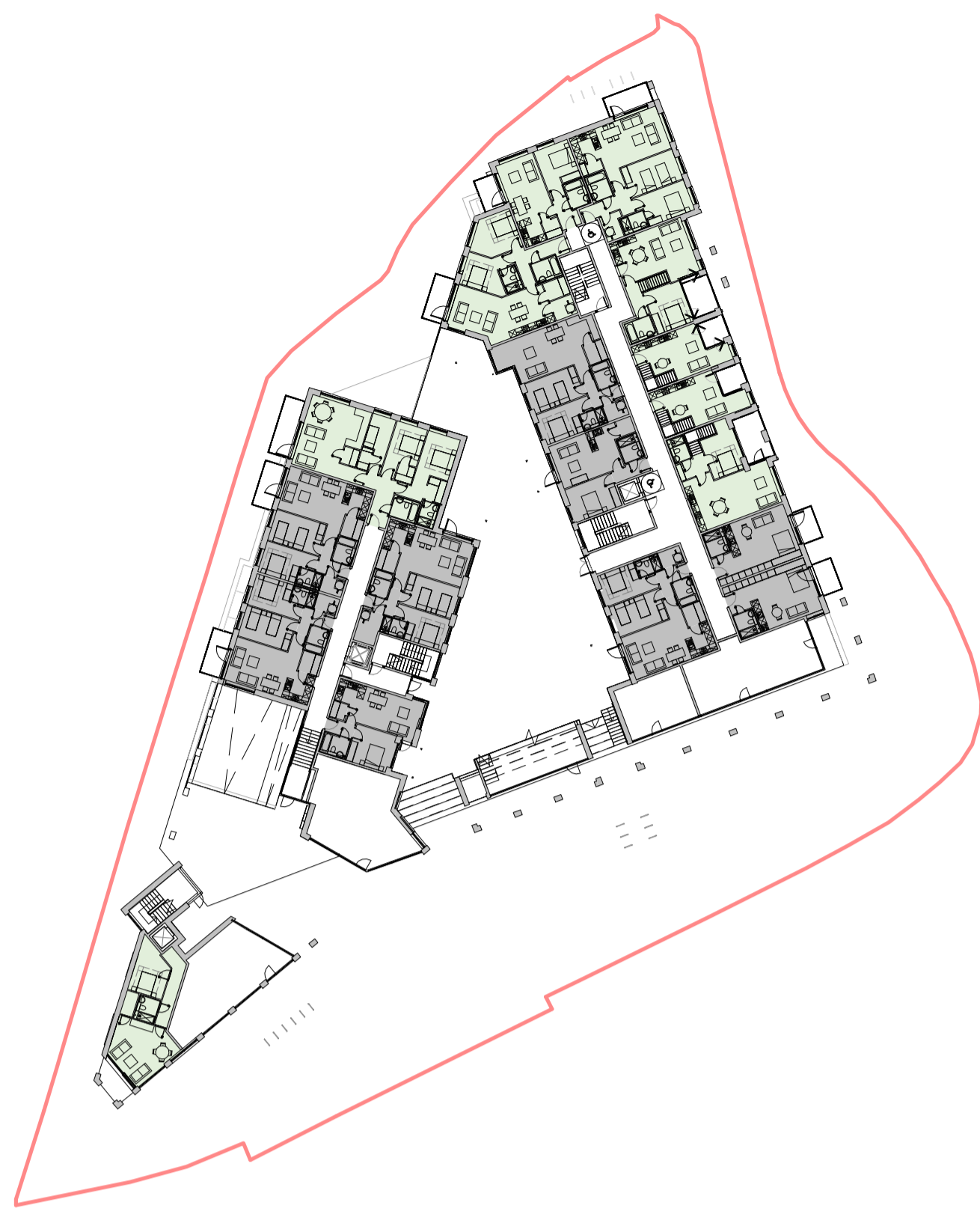
1 SHS-00 1:500