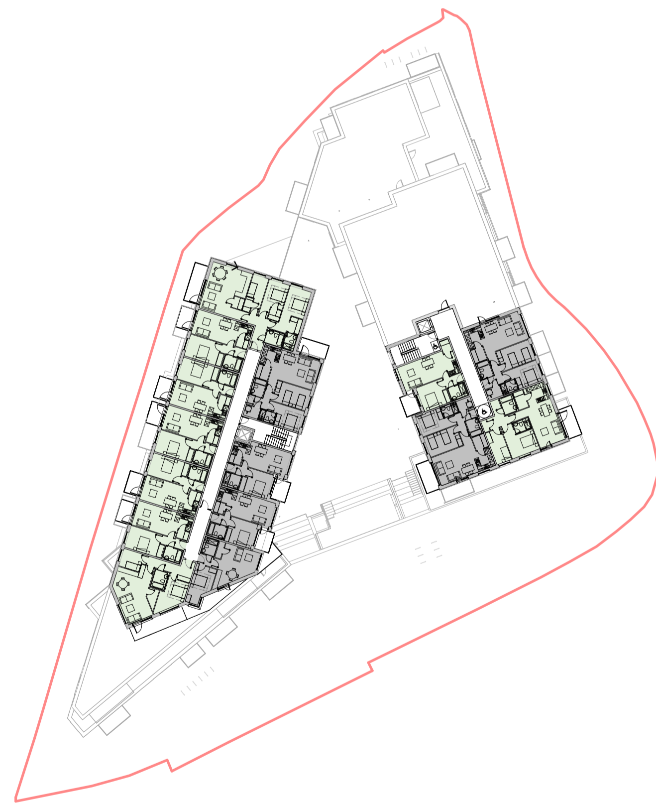
5 SHS-04 1:500