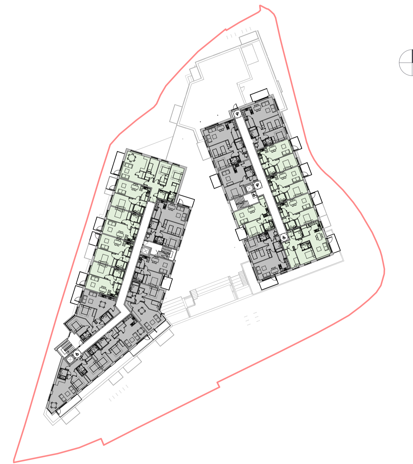
4 SHS-03 1:500