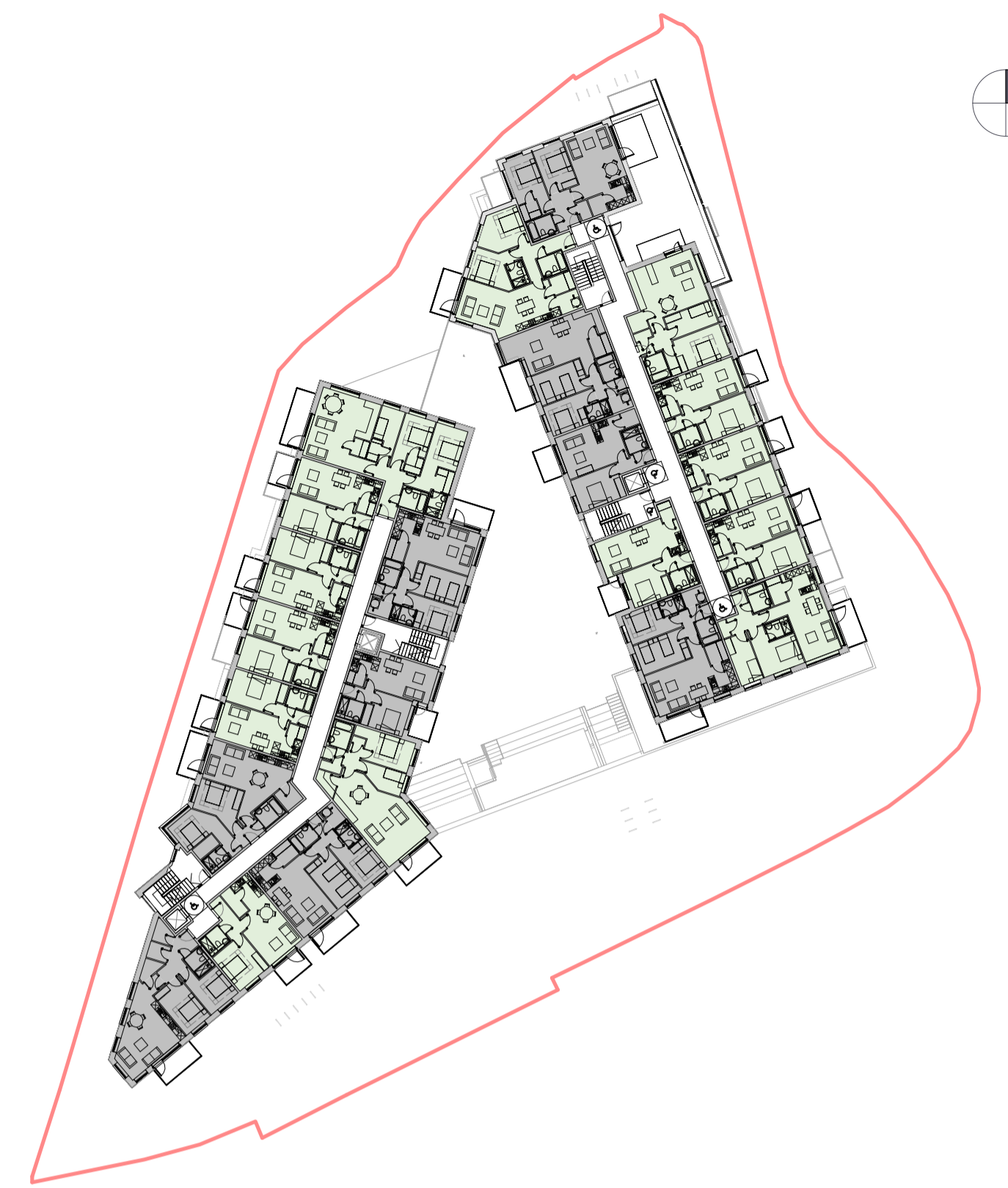
3 SHS-02 1:500