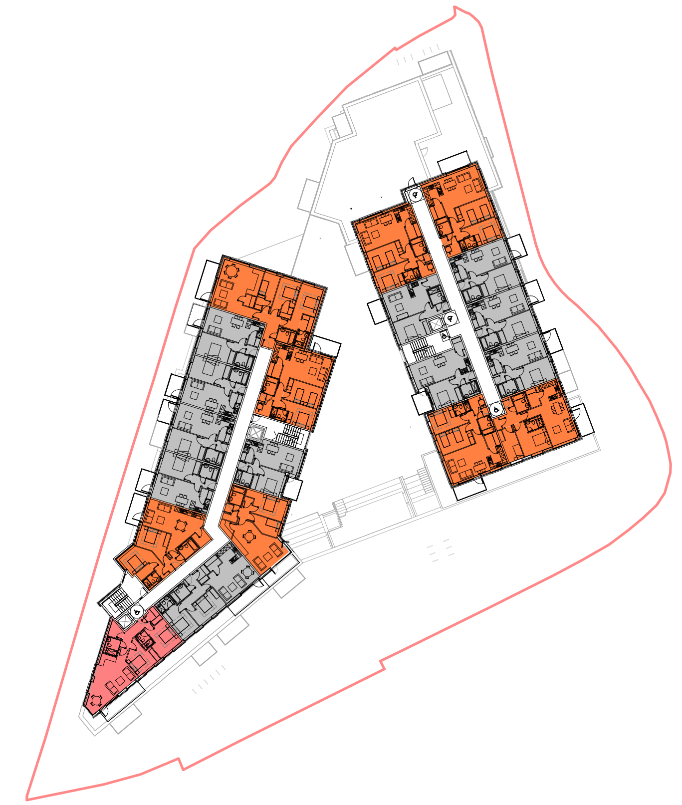
5 DA-03 1:500