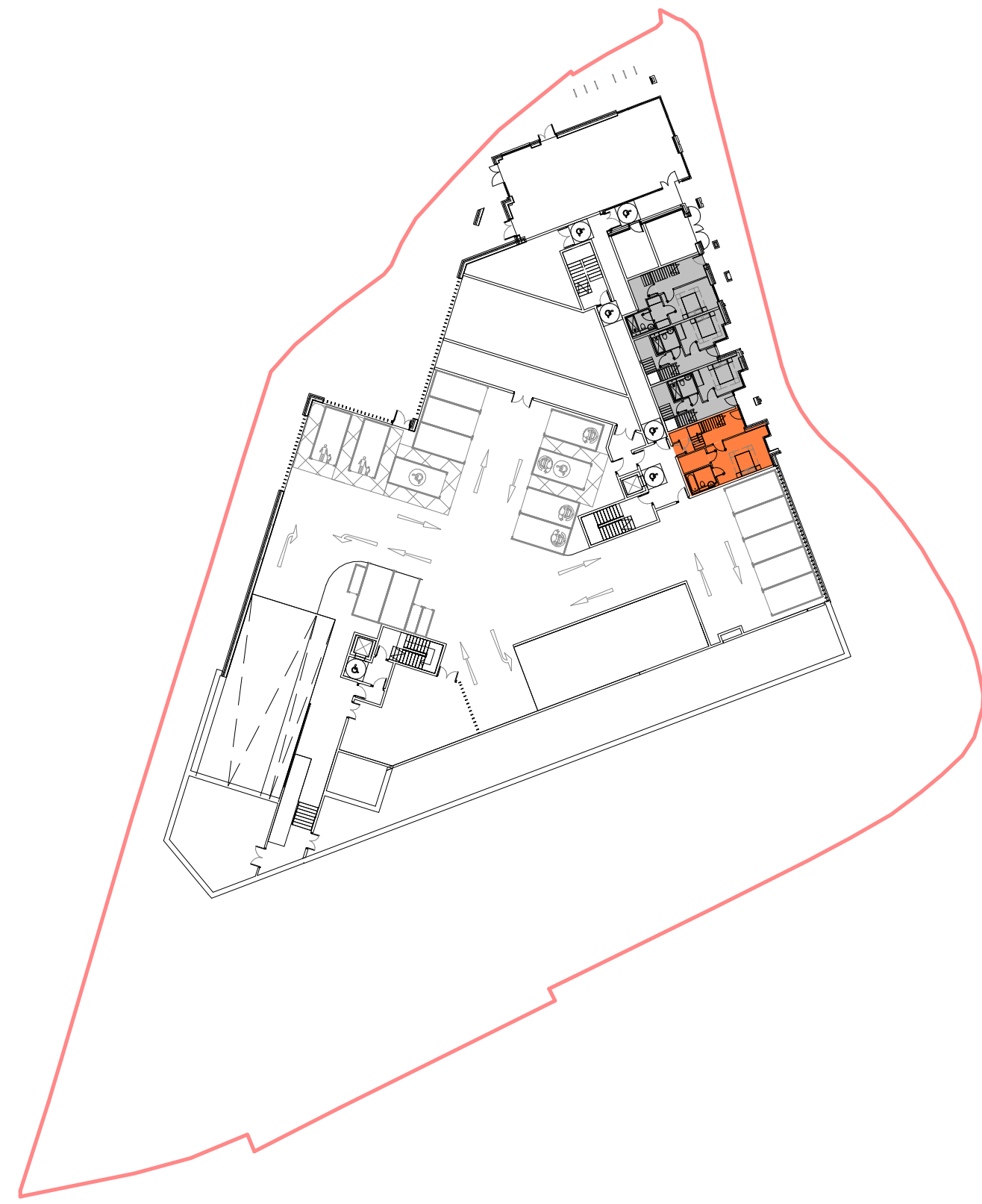
1 DA-B1 1:500