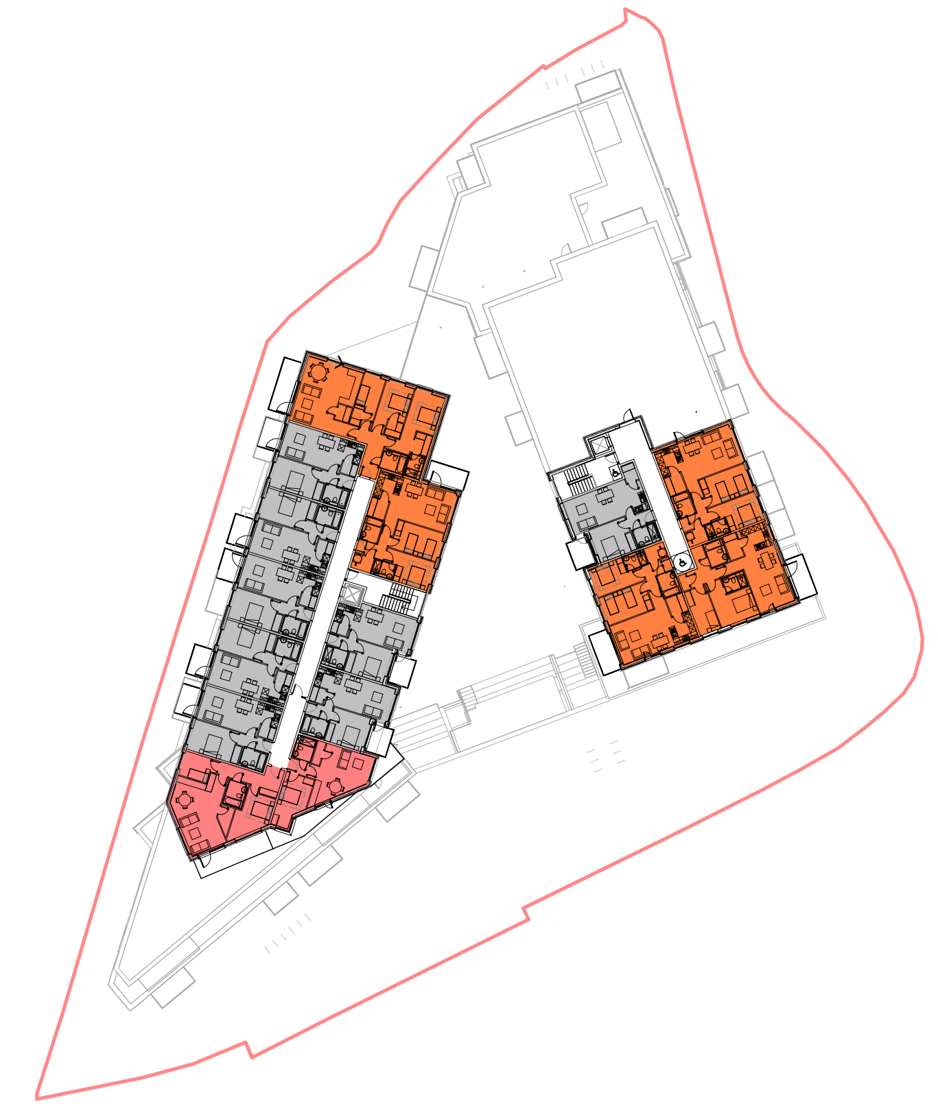
6 DA-04 1:500