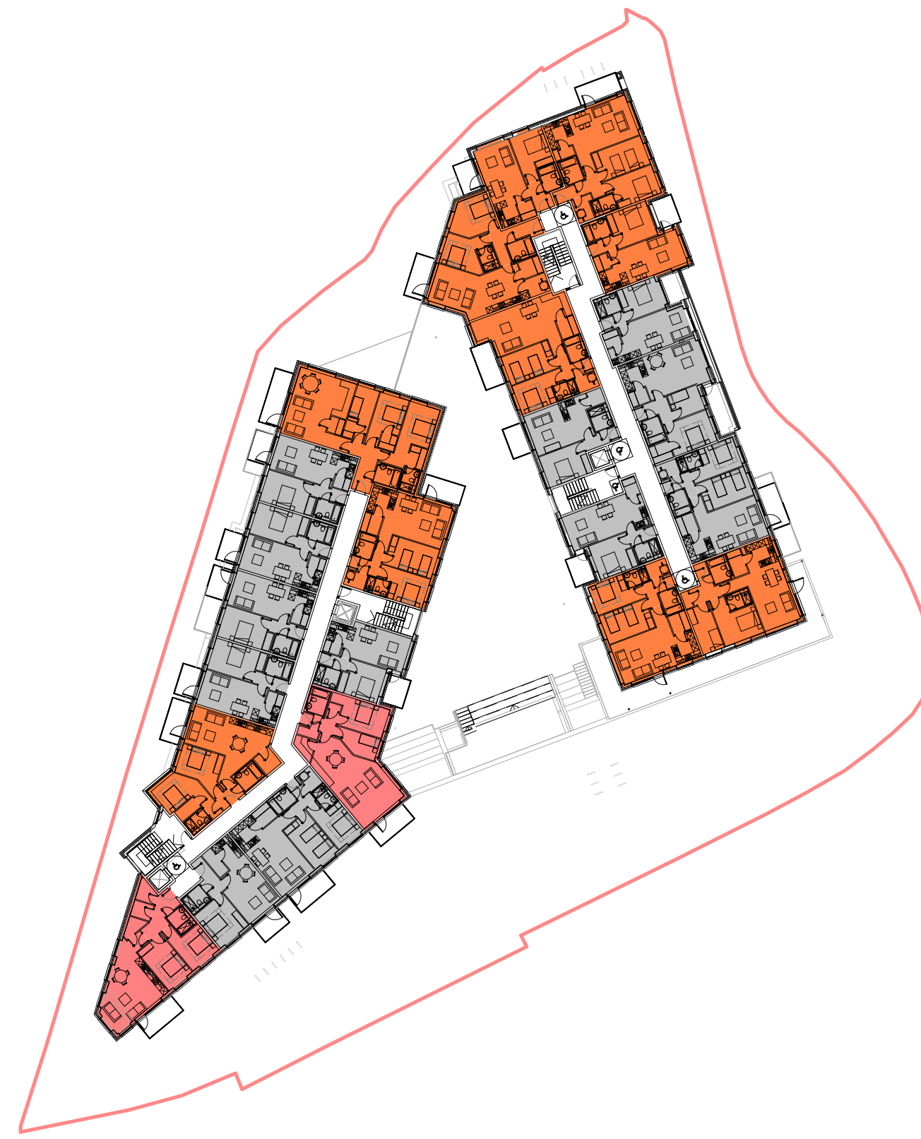
3 DA-01 1:500