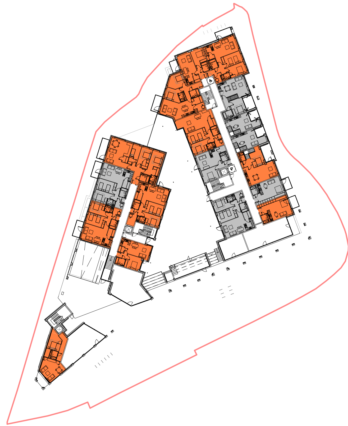
2 DA-00 1:500