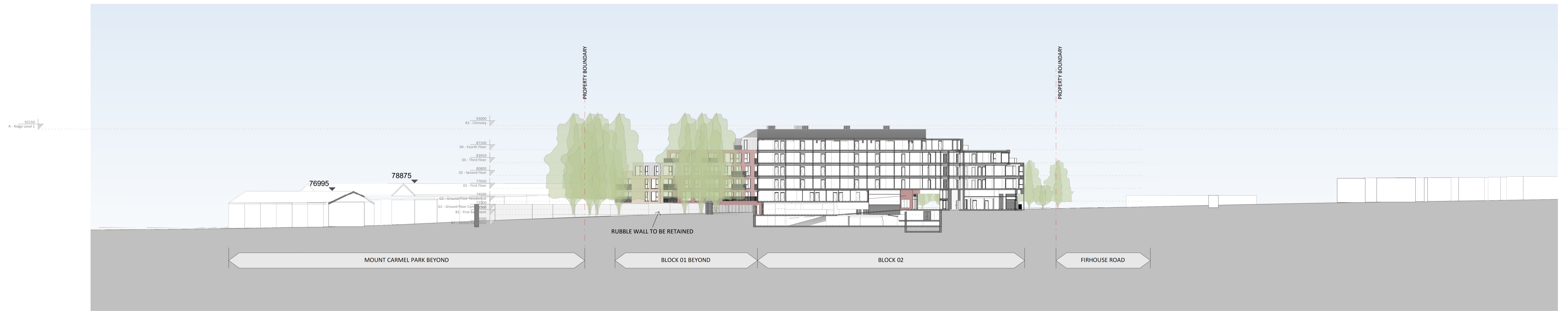
4 Section 4 - Contiguous Section East 1 : 500