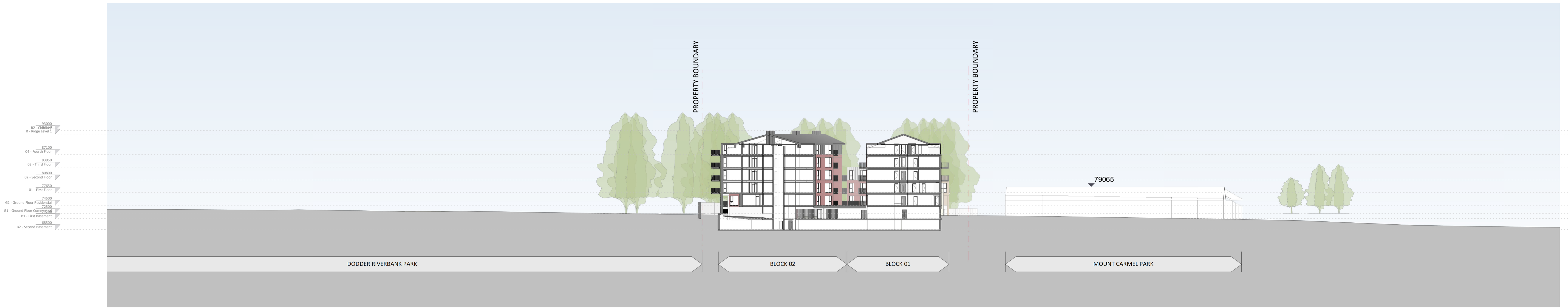
3 Section 3 - Contiguous Section North 1 : 500