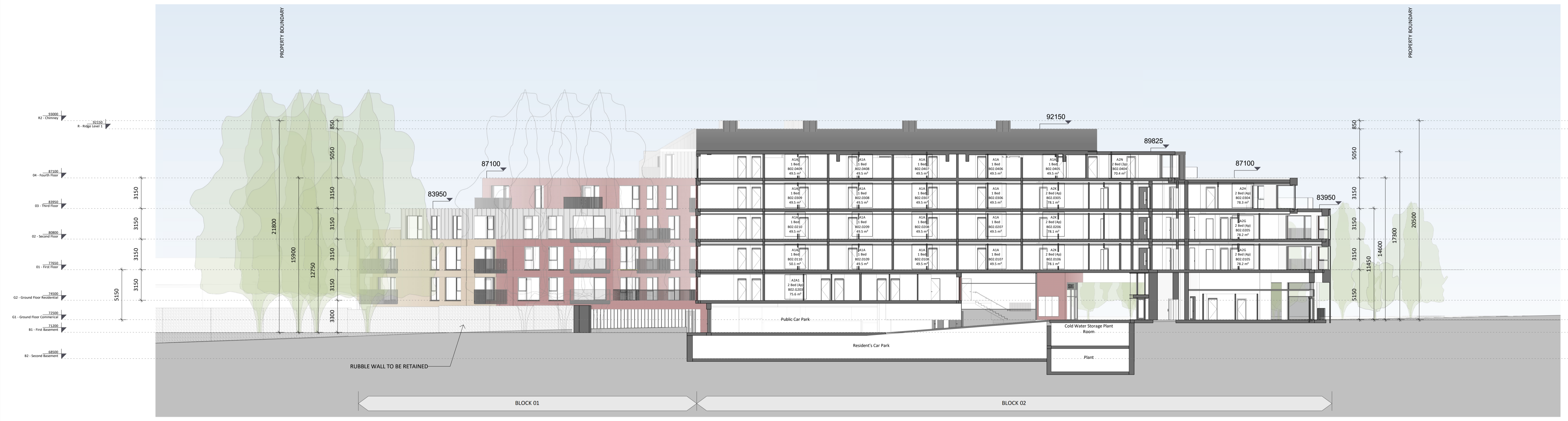
4 Section 4 - Block 02 Long Section 1:200