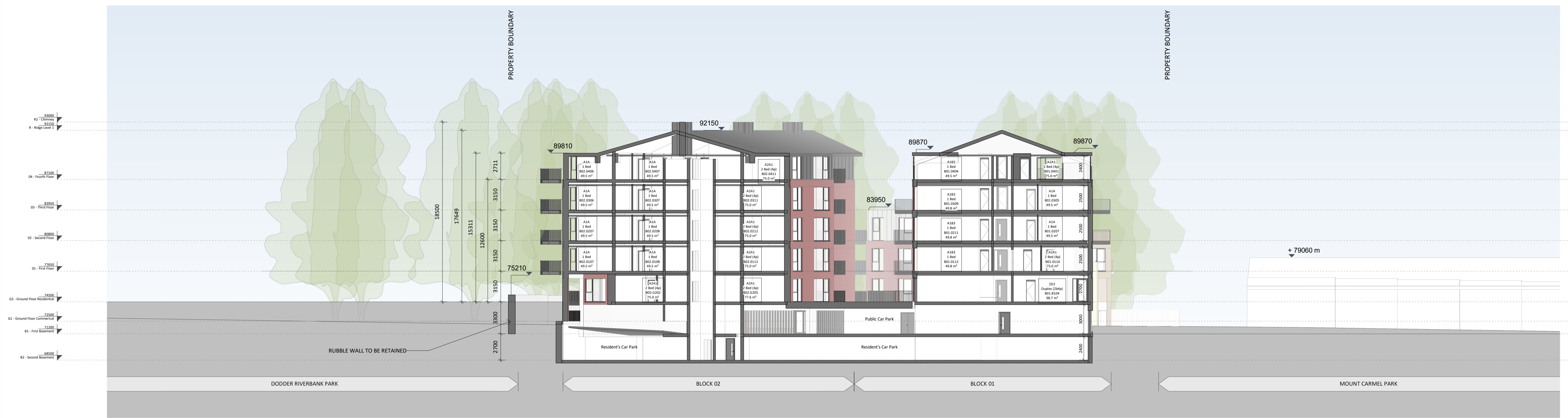
3 Section 3 - Block 01 Cross Section 2 1:200