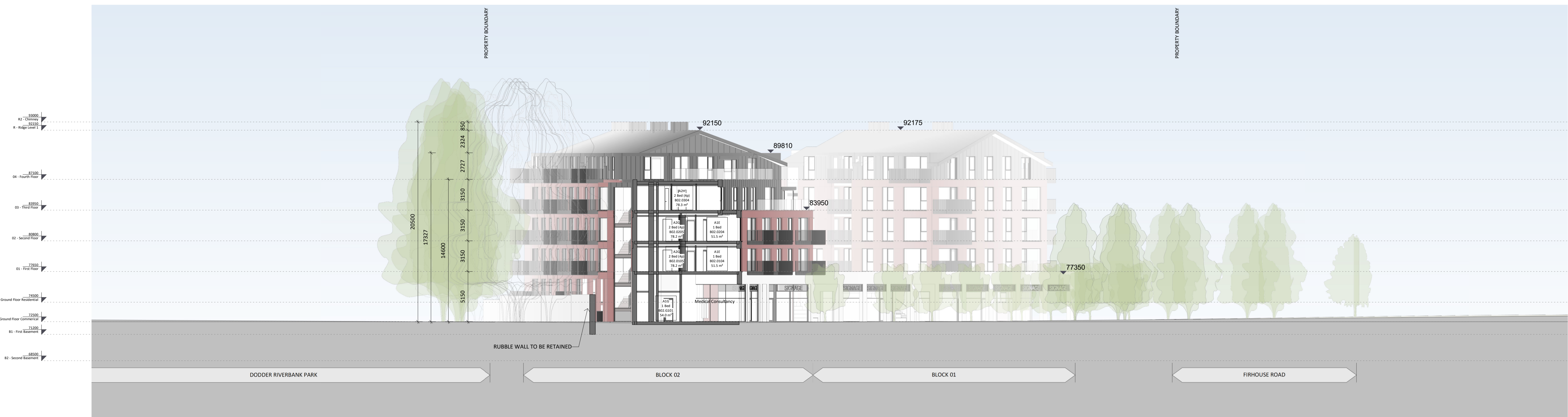
5 Section 5 - Block C 1 : 200