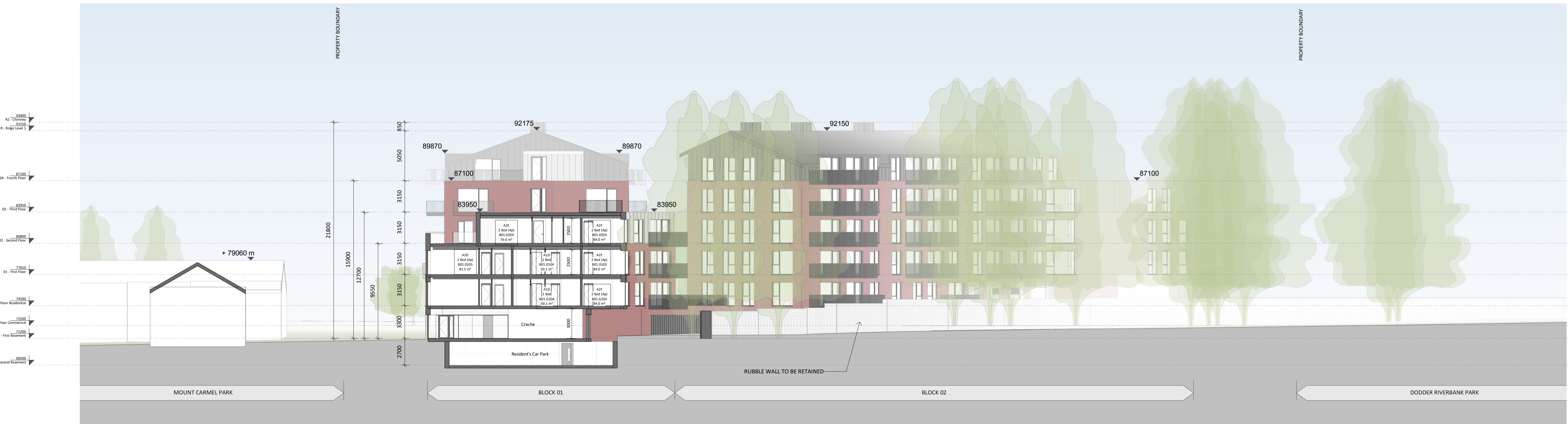
2 Section 2 - Block A Cross Section 1 1:200