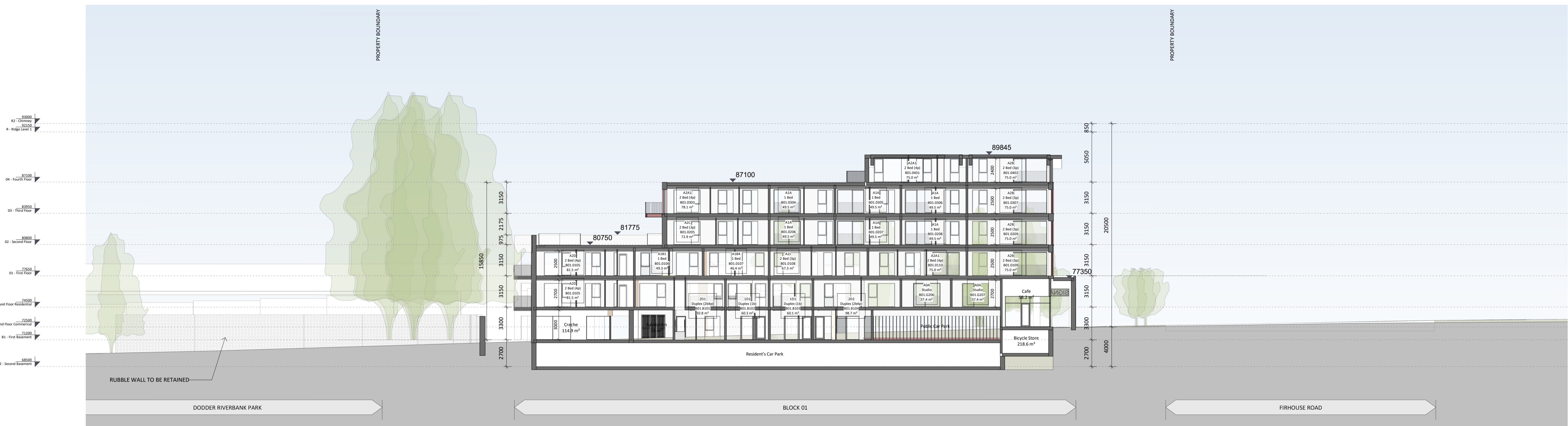
1 Section 1 - Block A Long Section 1:200