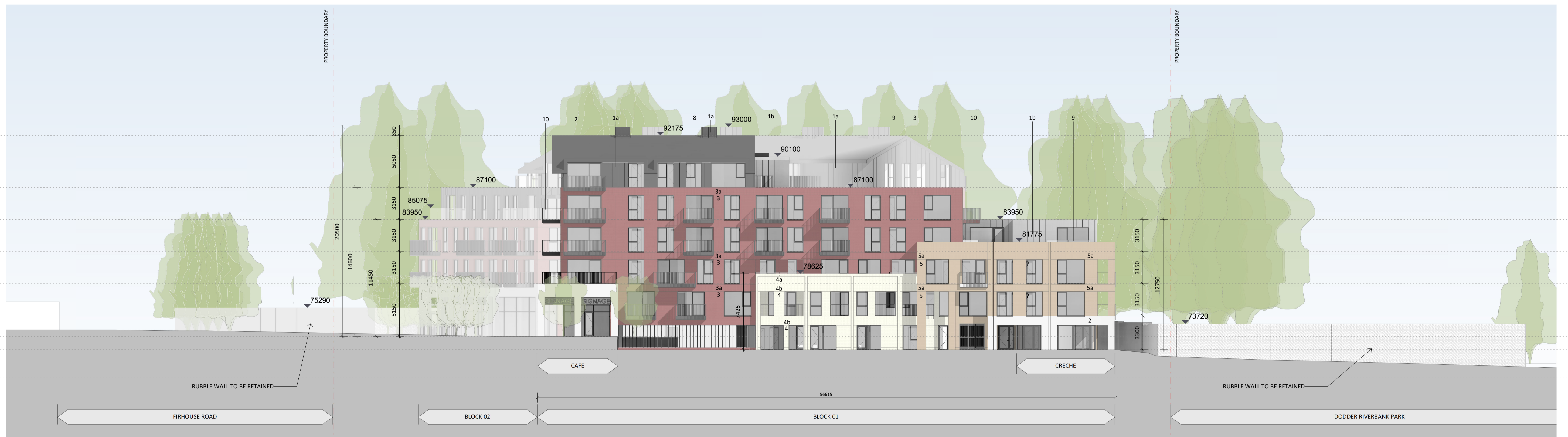
2b) Proposed Elevation 02 - Mount Carmel Pk Road (East) 1:200