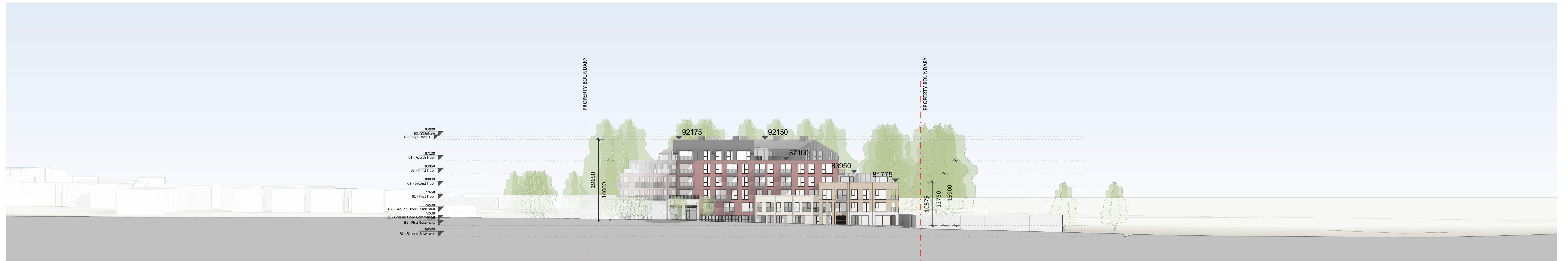
2a) Proposed Elevation 02 - Mount Carmel Pk Road (East) 1:500