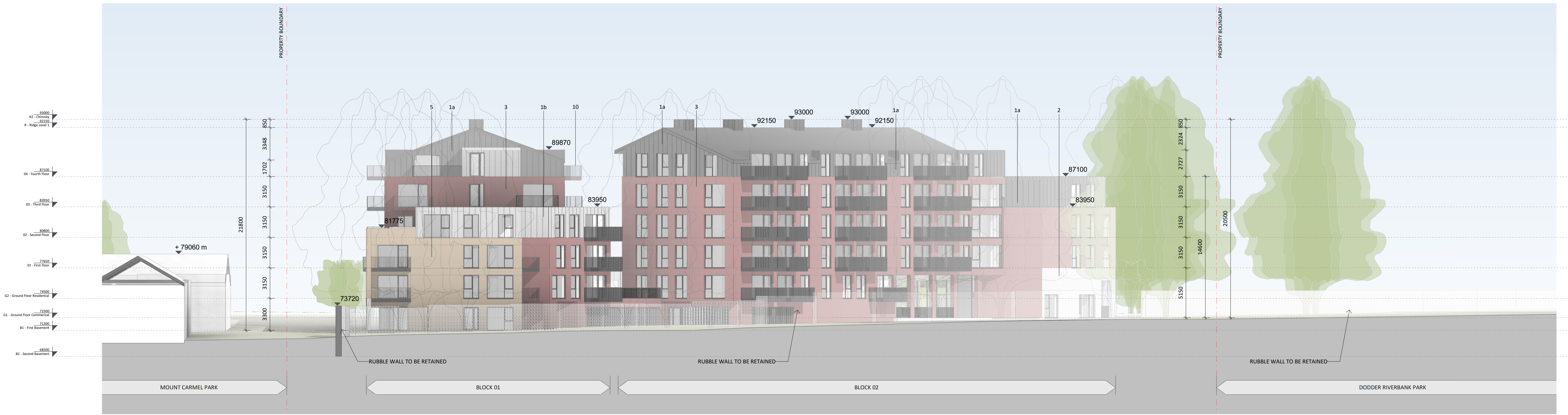
3 Proposed Elevation 03 - North Elevation 1 : 200