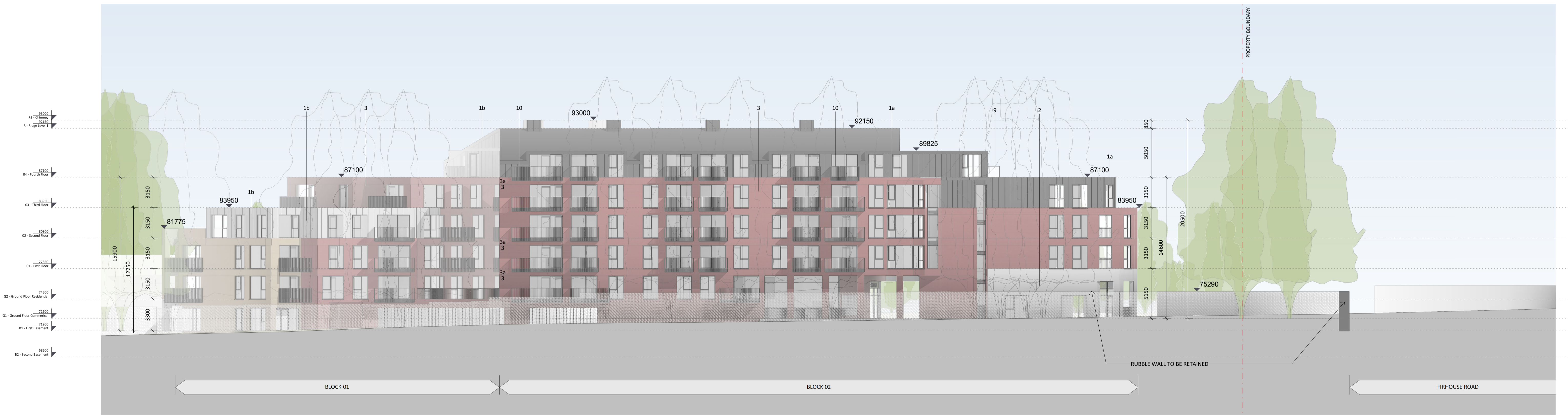
1 Proposed Elevation 04 - West Elevation 1 : 200