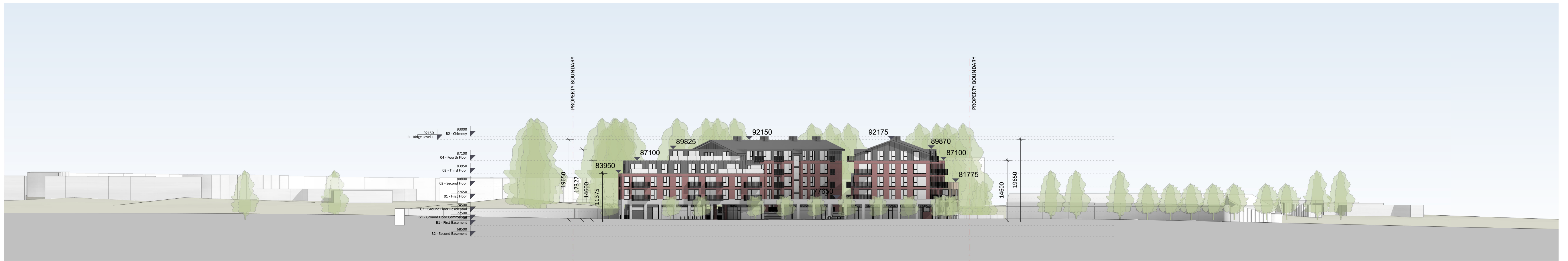
1a Proposed Elevation 01 - Firhouse Road (South) 1:500