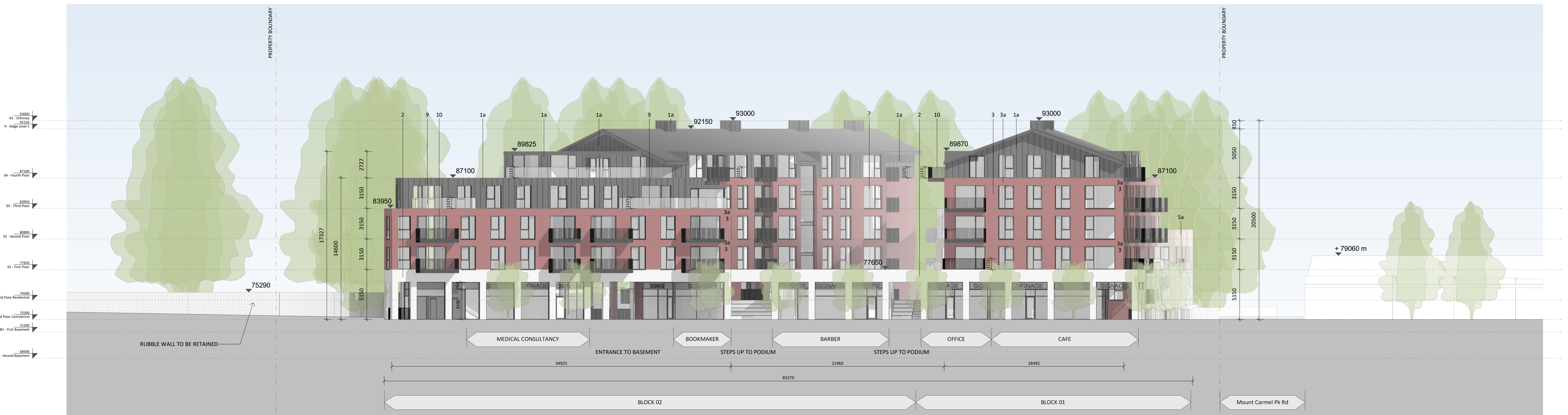
1b Proposed Elevation 01 - Firhouse Road (South) 1:200