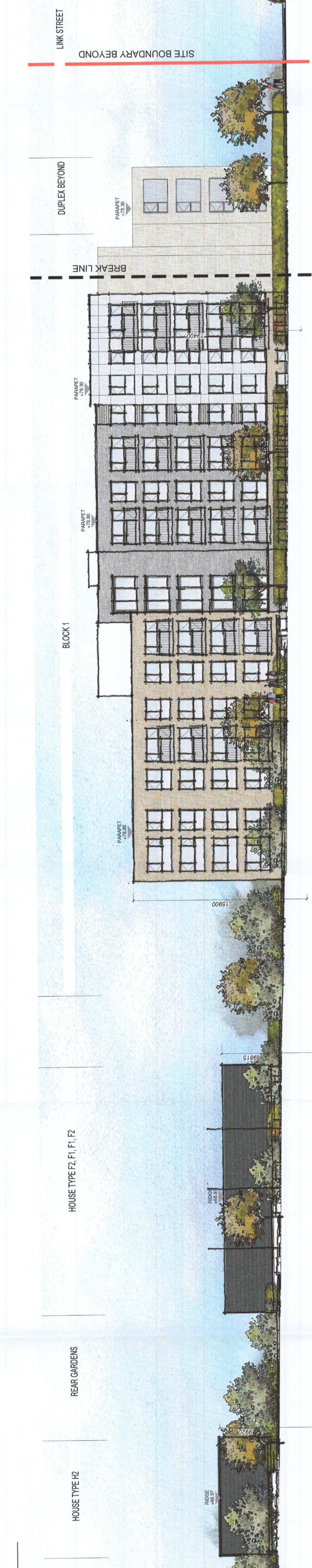
02 SECTION D - D SCALE 1:200 @ A0