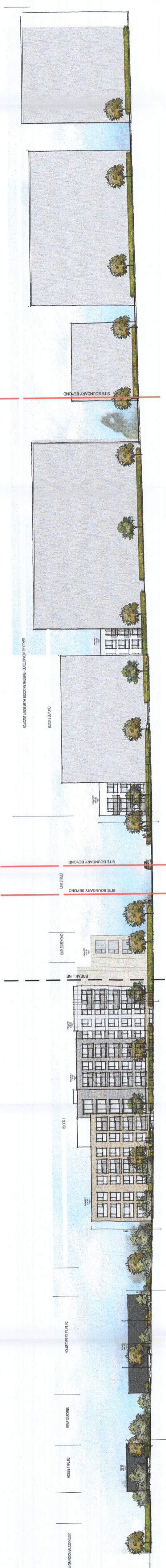
01 SECTION C - C SCALE 1:500 @ A0