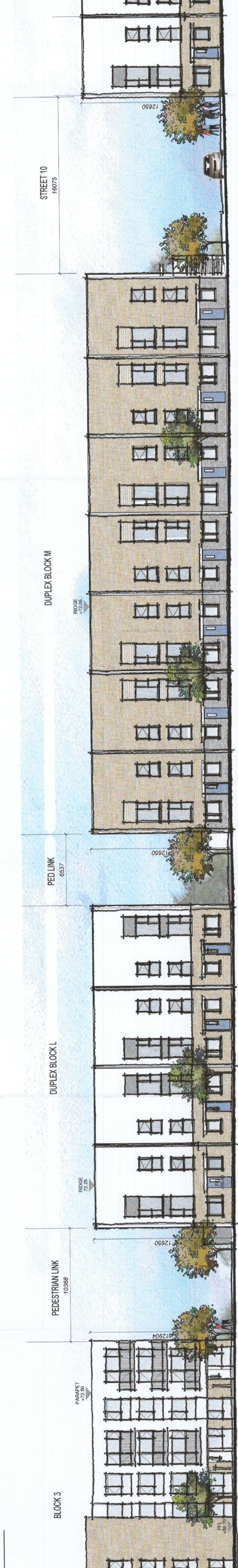
04 SECTION D - D SCALE 1:200 @ A0